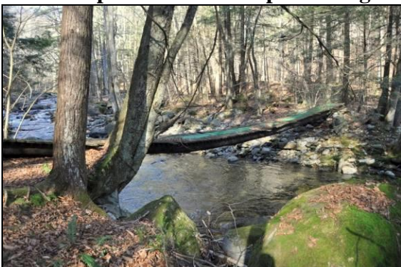
Old, Washed-Out Bridge