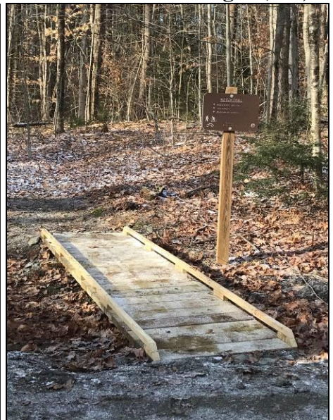
Bridge and Signage