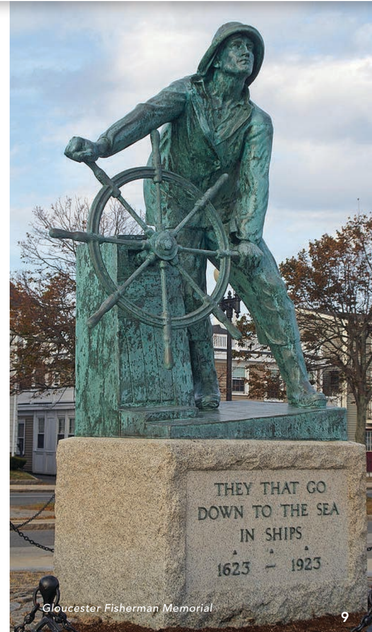
Gloucester Fisherman Memorial