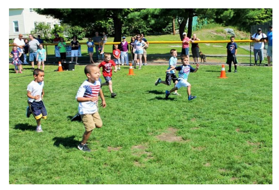
Trafton Park, Malden