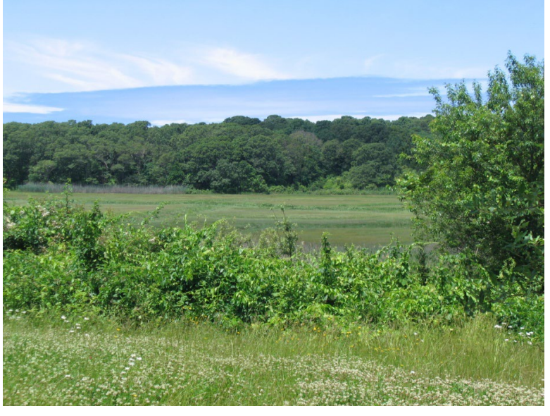
Punkhorn Parklands, Brewster