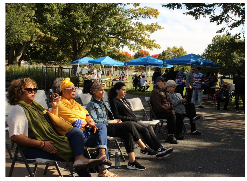
Kenefick Park, Springfield