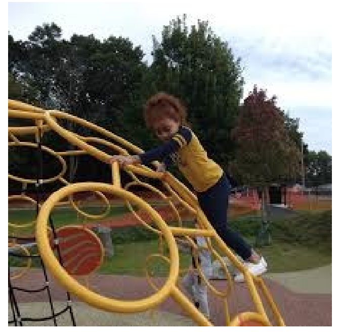
Hovey Field, Lowell