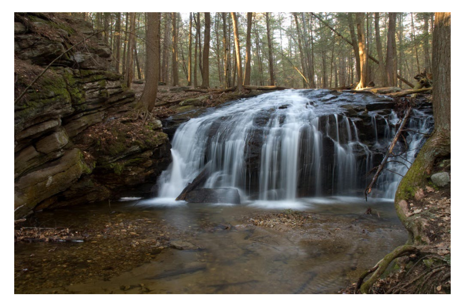
Holland Glen Forest, Belchertown