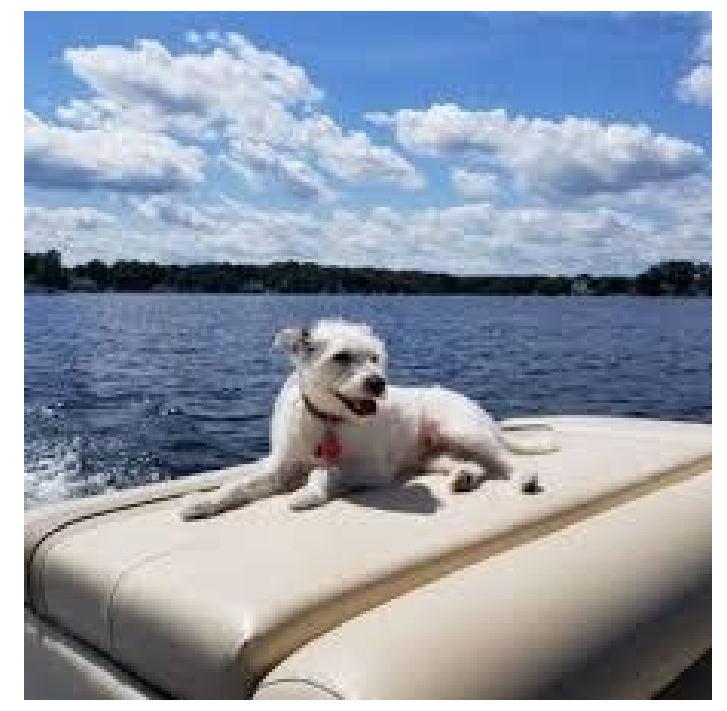
Webster Lake Beach, Webster