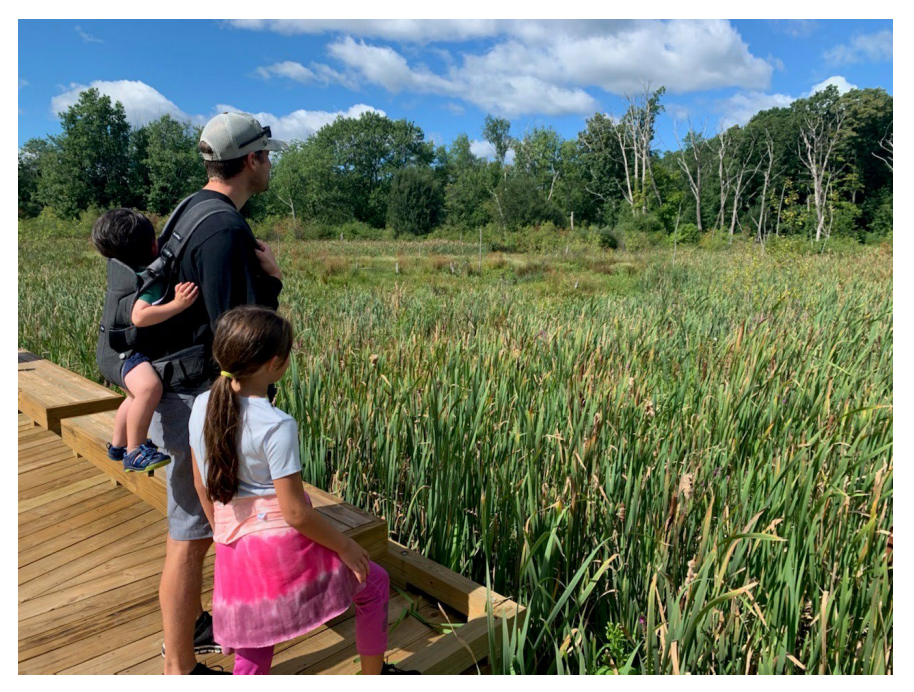
Mary Cummings Park, owned by City of Boston, located in Town of Burlington