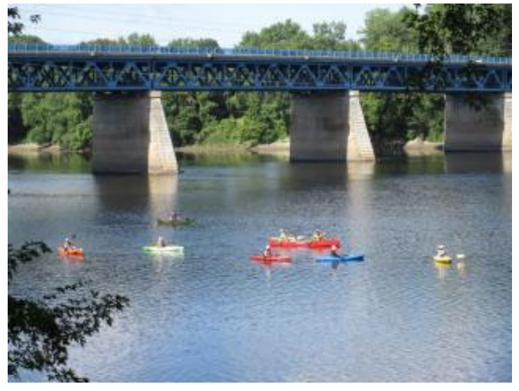
Riverside Park, Sunderland