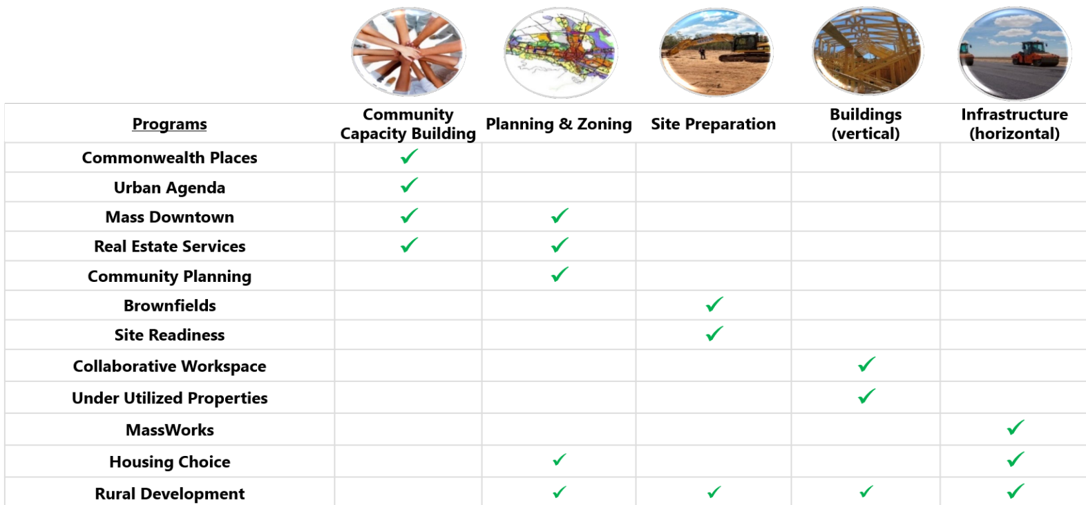
Figure 1: One Stop for Growth Development Continuum.

The Community One Stop for Growth is a single online application portal designed to allow applicants to apply for consideration of multiple sources of funding to support multiple phases and facets of a project. To help guide applicants, the One Stop uses a Development Continuum or lifecycle that describes how a typical economic development project moves from concept to reality within diverse communities. The One Stop encourages applicants to think about their economic development priorities in the context of this Development Continuum, both to guide applicants towards best practices and strategies and to help applicants identify the types of projects that will help achieve their economic development priorities. Applicants should consider this spectrum of activities as it prepares to submit applications to the One Stop, thinking fully about the steps necessary for progress in the development of a project.