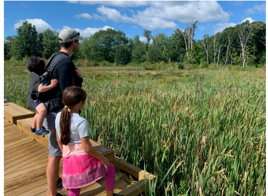
Mary Cummings Park, owned by City of Boston, located in Town of Burlington