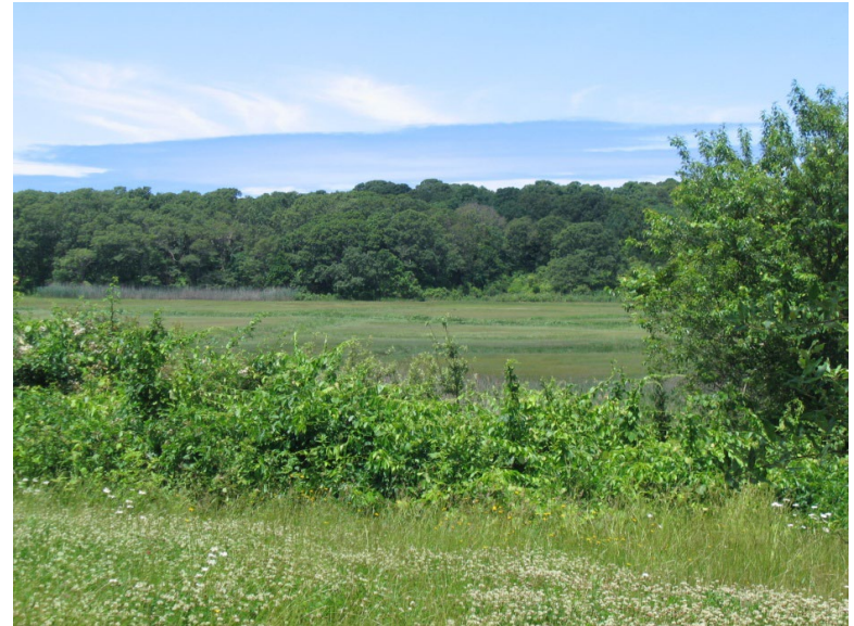
Punkhorn Parklands, Brewster