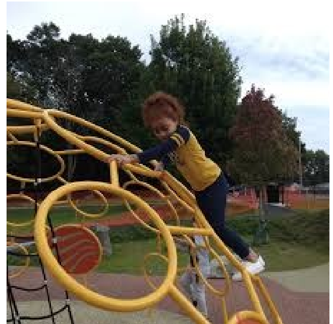
Hovey Field, Lowell