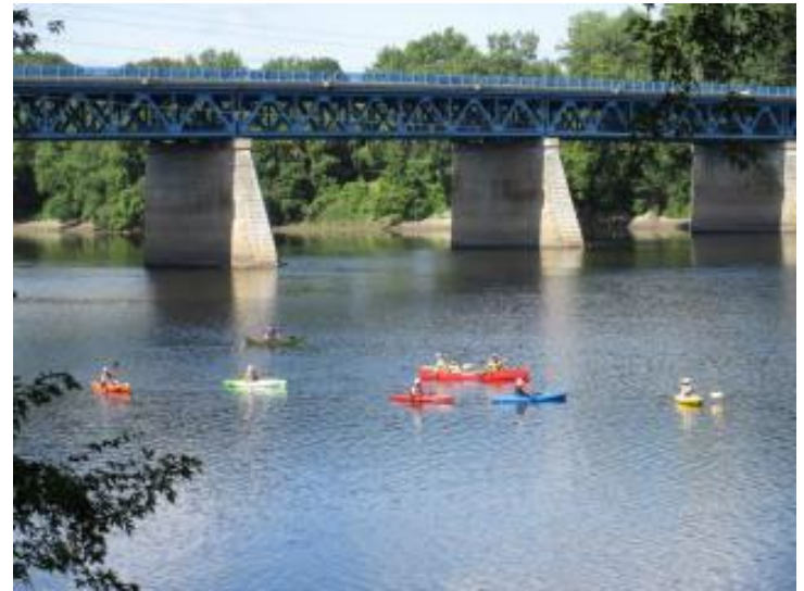
Riverside Park, Sunderland