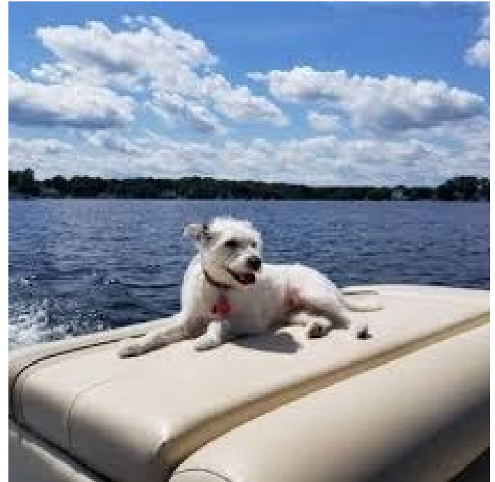
Webster Lake Beach, Webster