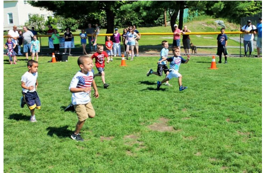
Trafton Park, Malden