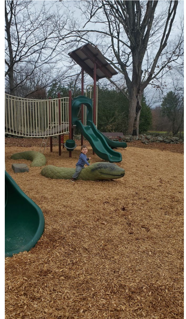
Lewis Field, Brookfield