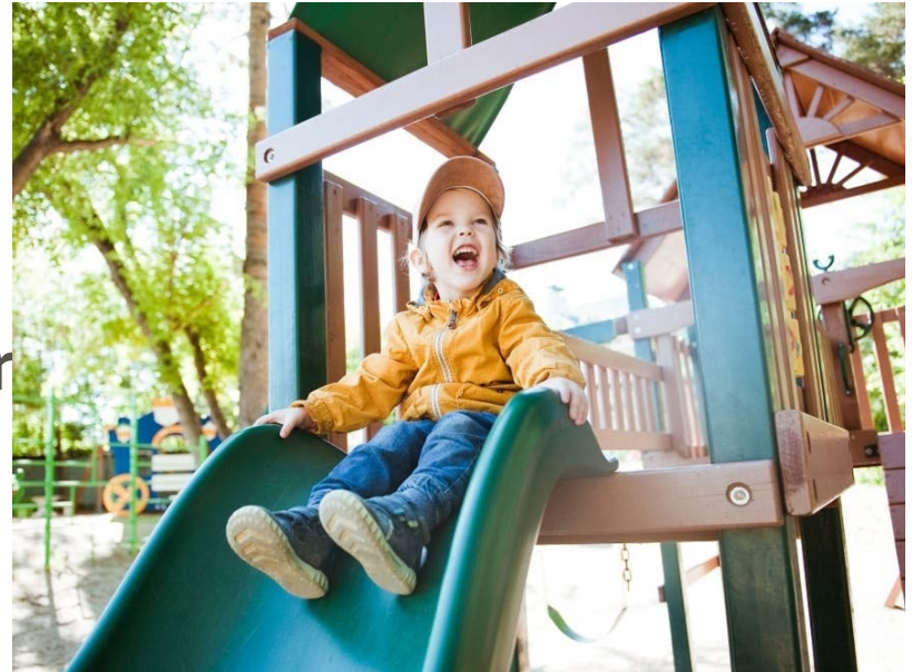
Central Hill Playground, Somerville