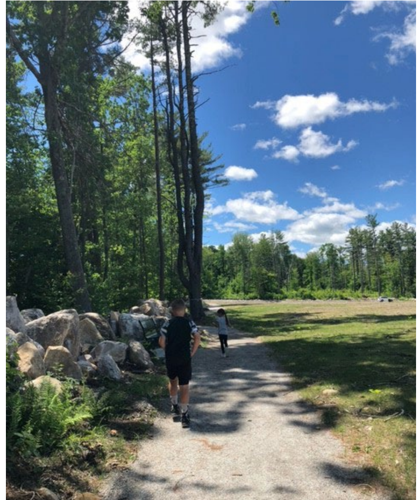
Bailey Brook Park, Gardner