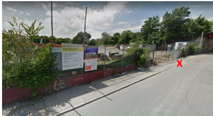
Figure 2 – Street view of the incident location including the fenced construction site with gate. The X indicates location of the crash.