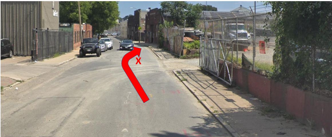
Figure 3 – Street view of Incident location, including the construction site entrance located on the right. The arrow indicates the dump truck travel direction. The X indicates the approximate location of the crash.

the dump truck was traveling approximately 10 mile per hour. As the dump truck started turning right to enter the construction site, the truck and the victim, who was on his bike and located on the right-hand side of the truck, collided. It was reported that the victim might have tried to stop his bike and his bike skidded on the dirt and loose gravel. A motorist behind the dump truck witnessed the collision and stopped his car to notify the truck driver what had happened. The dump truck operator did not realize his truck had struck a person. Multiple calls were placed for emergency medical services (EMS). EMS arrived quickly and the victim was pronounced at the incident location.