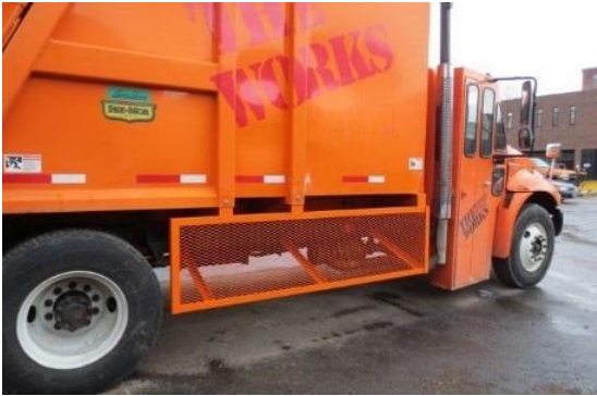
Figure 4 – Refuse truck with a side guard installed

Massachusetts, some communities require side guards on large trucks in some capacity. For example, one local municipality has an ordinance that requires large trucks to have side guards before contract work requiring large trucks for that municipality can begin. 10 Another municipality is incorporating side guards on the large trucks and buses that the municipality has ownership over. 11 All owners of large vehicles and semi-trailers should consider incorporating side guards.