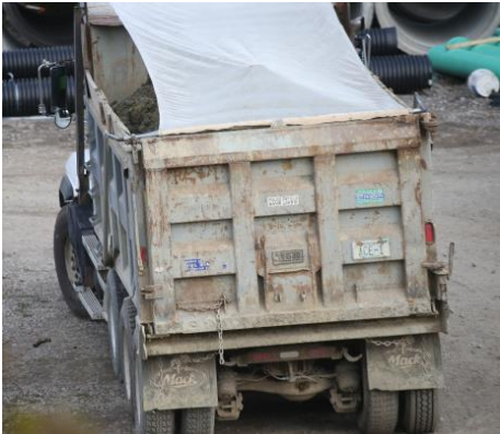
Figure 1 – Dump truck involved in the incident

The truck involved in the incident was a 10 wheeled tandem axel dump truck manufactured in 1997 (Figure 1). The dump truck body was loaded with soil at the time of the incident and the total weight of the truck was determined to be 78,750 pounds. After the incident, the truck went through a Federal Motor Carrier Safety Alliance (FMCSA) Level 1 Safety Inspection. Multiple violations were identified at the time of the safety inspection and the truck was placed out of service.