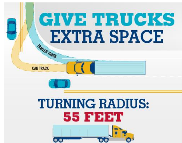
Infographic 2 – Give Trucks Extra Space

Recommendation #4: Employers who utilize independent contractors should comply with the Massachusetts Independent Contractor Law to ensure employees are not misclassified as independent contractors.