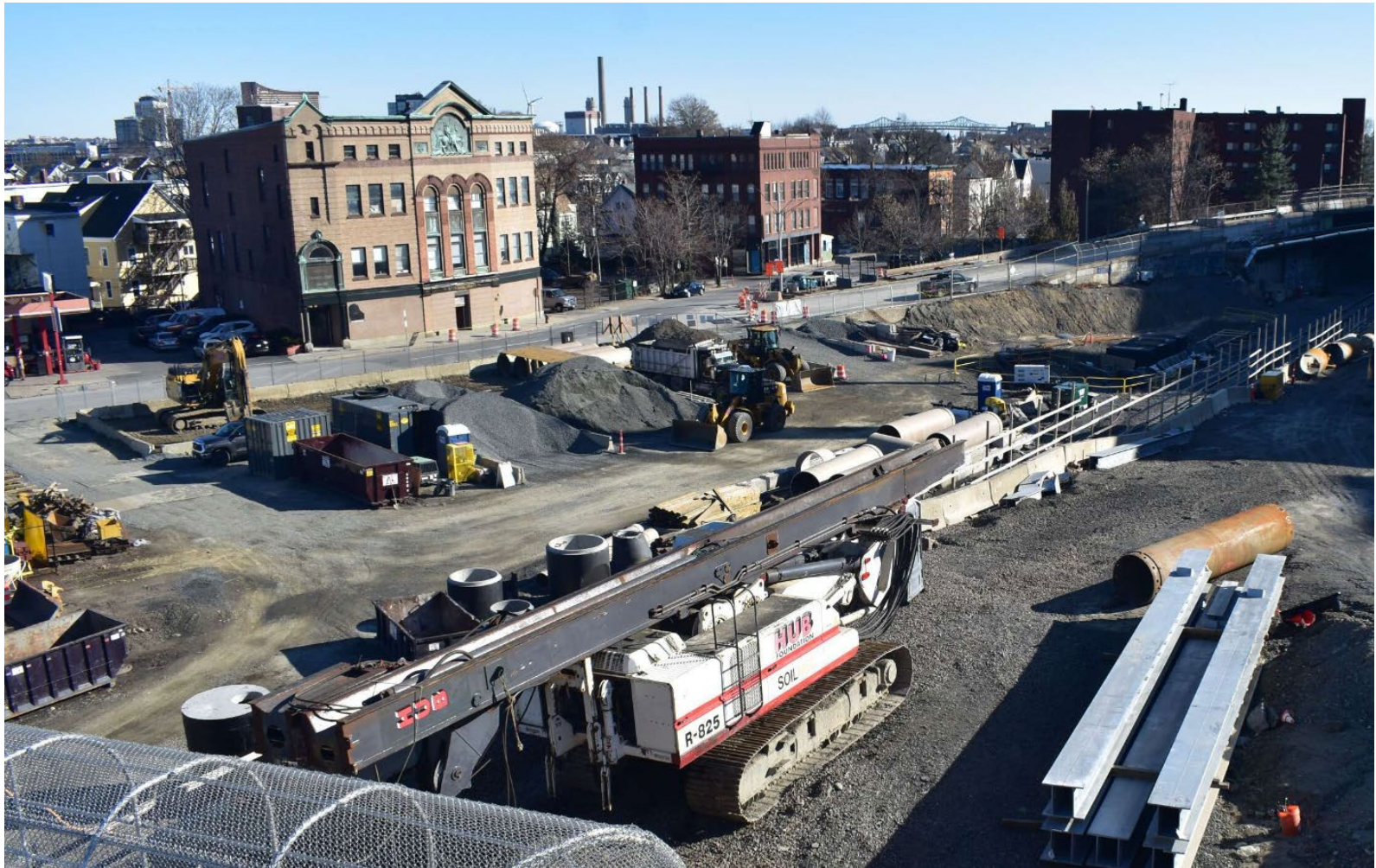
Utility Isolation, Hazardous Material Abatement, and Demolition