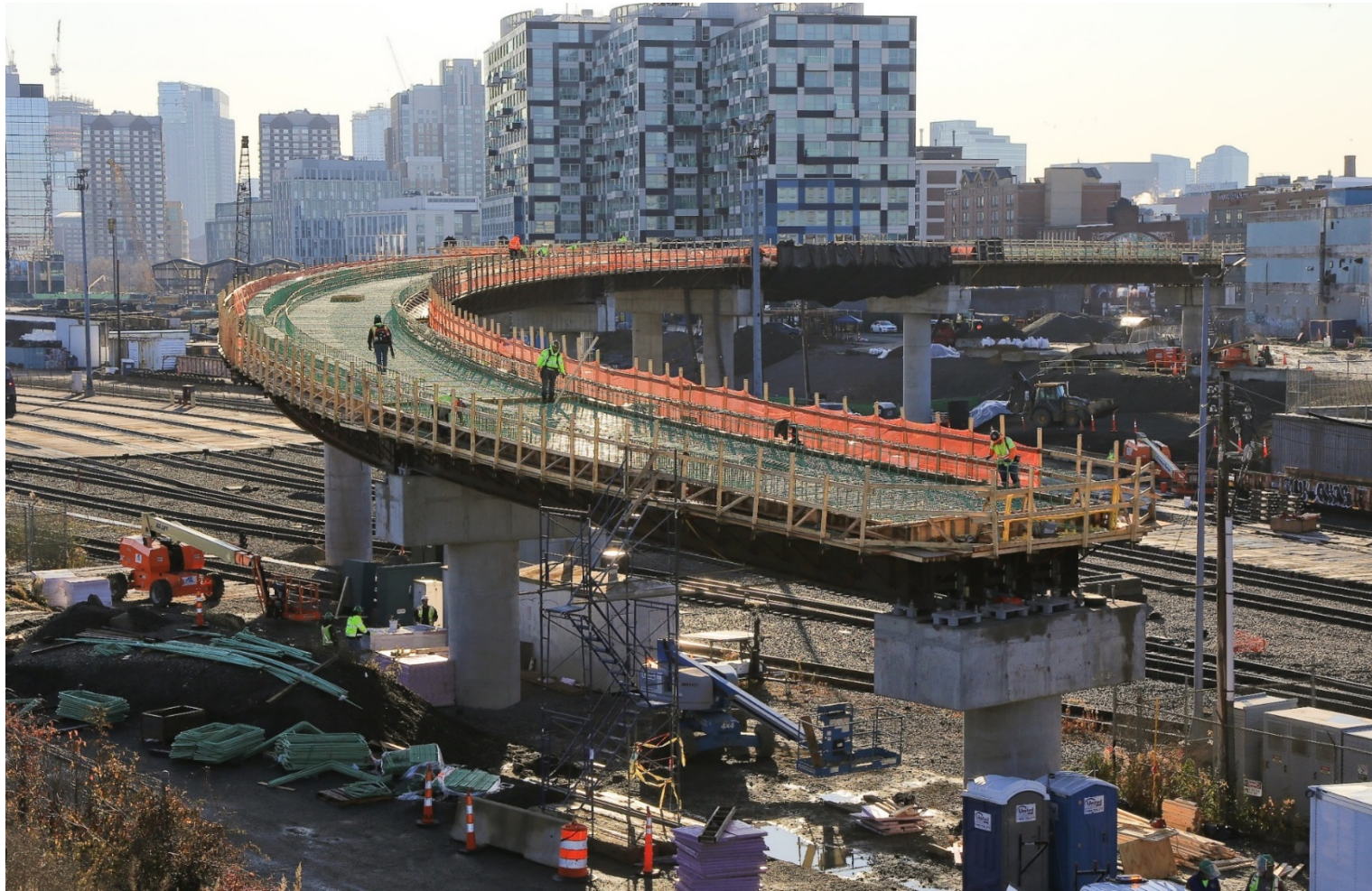
Viaduct / Drilled Shaft Work