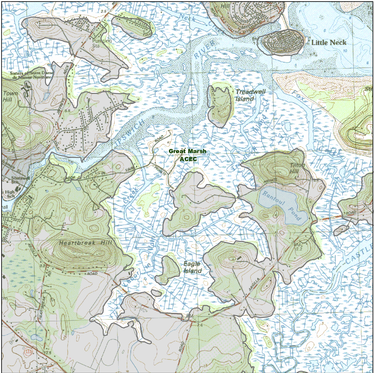
Map # 9j Great Marsh ACEC Map Tile 10 of 15 ACEC Designated 3/2/79 25,500 Acres