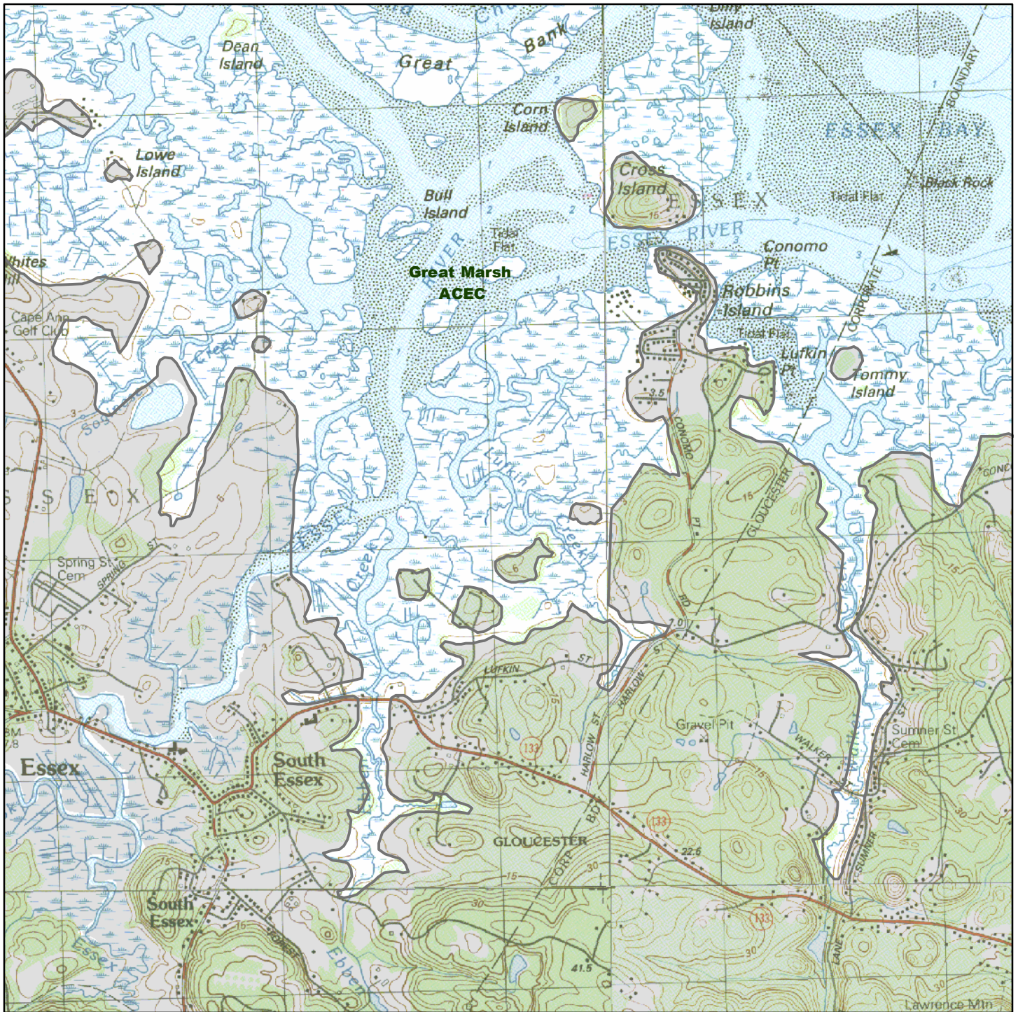
Map # 9n Great Marsh ACEC Map Tile 14 of 15 ACEC Designated 3/2/79 25,500 Acres