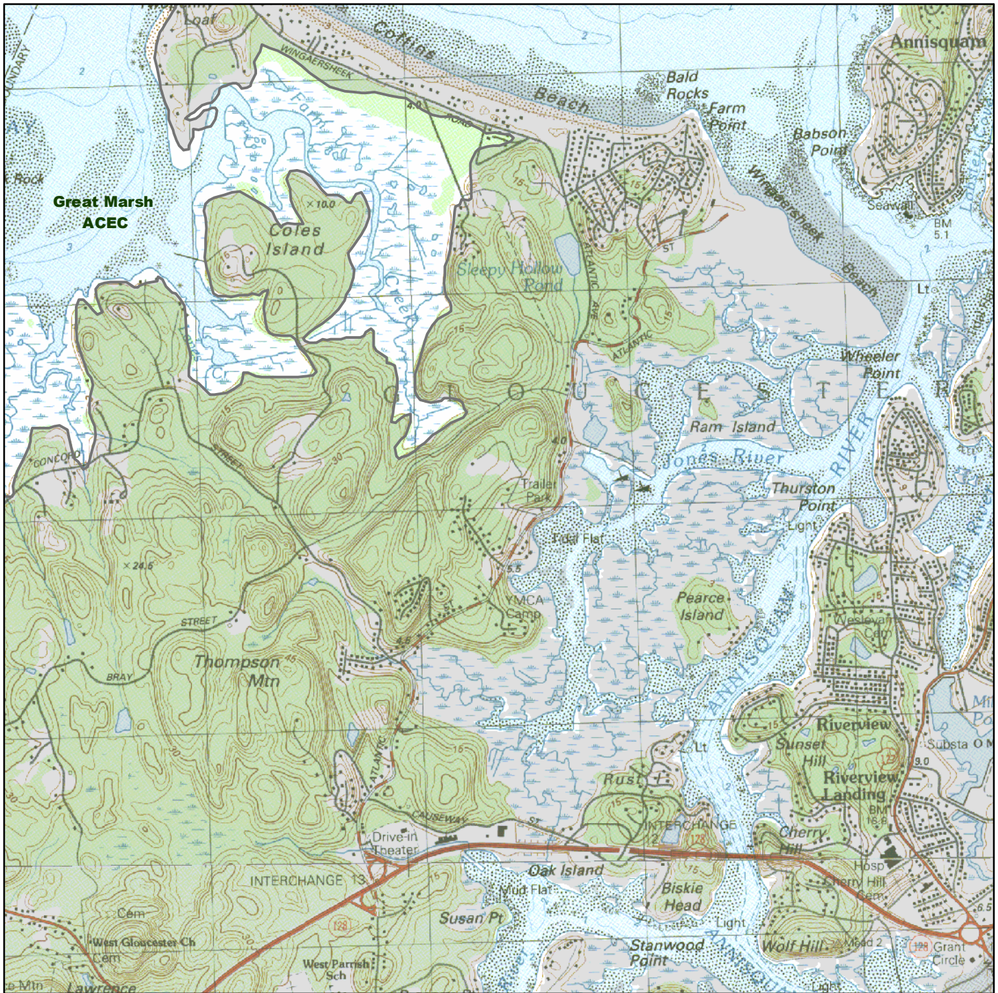
Map # 90 Great Marsh ACEC Map Tile 15 of 15 ACEC Designated 3/2/79 25,500 Acres