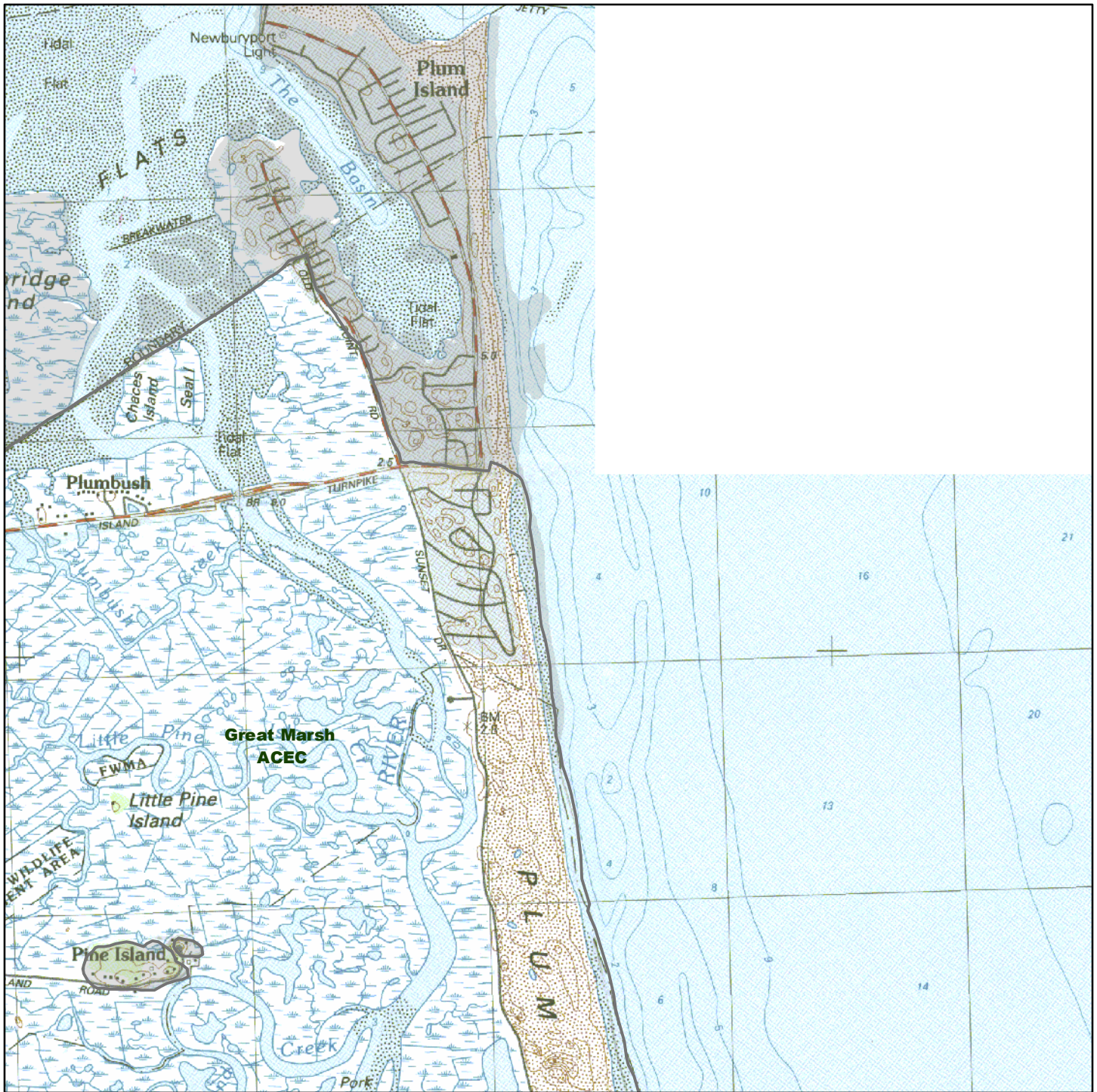
Map # 9b Great Marsh ACEC Map Tile 2 of 15 ACEC Designated 3/2/79 25,500 Acres