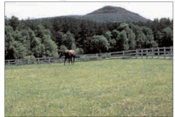
This farm was preserved as a community asset in this Massachusetts open space subdivision.

A study in Amherst, Massachusetts showed homes in an open space development appreciated 12.7% faster over 20 years than homes in a conventional subdivision of the same overall density.