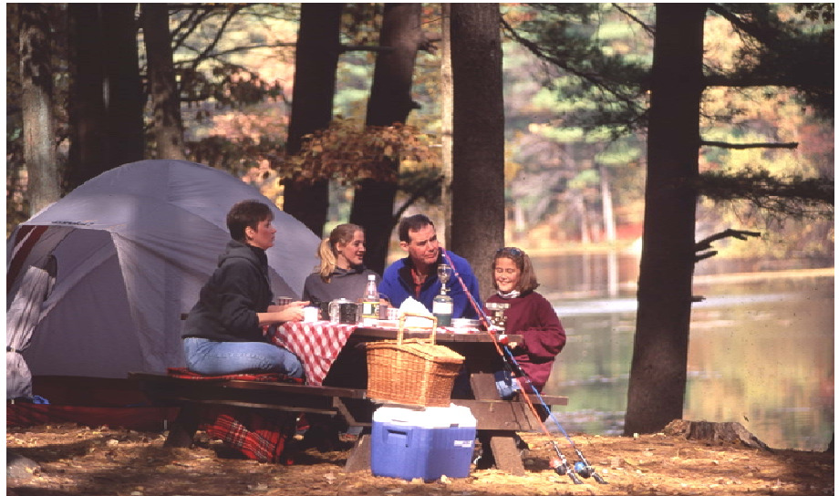
Camping at Frye Pond

Located less than an hour's drive north of Boston, Harold Parker State Forest offers 3,295 acres of rolling hills, low lying swampy areas, rocky outcrops and 11 ponds. Recreational activities are plentiful offering opportunities for hiking, mountain biking, camping, picnicking, swimming, fishing, boating, horseback riding, cross country skiing and hunting.