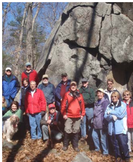
Wednesday Hike to Balance Rock

The management plan identifies 77 management recommendations intended to provide guidance for achieving balance between the protection of important natural and cultural resources while providing a variety of sustainable outdoor recreation opportunities.