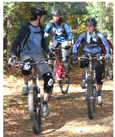
Wicked Ride of the East