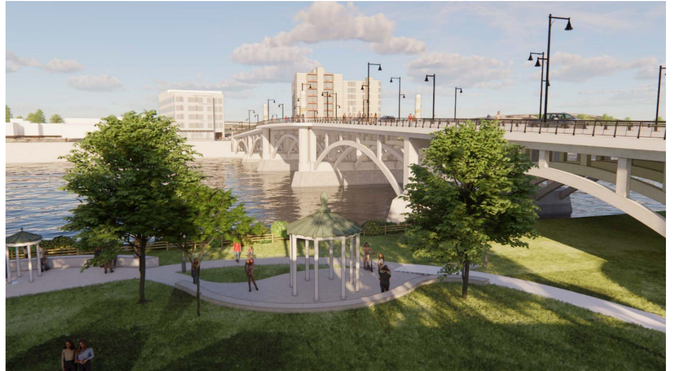
Proposed Basiliere Bridge