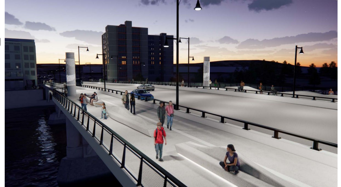
Proposed Overlook Rendering