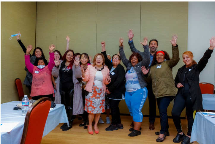
Northeast Community Forum, May 3