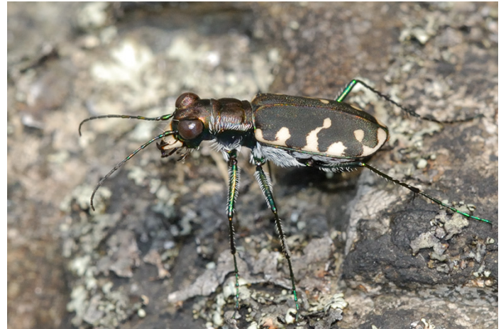
Cicindela rufiventris hentzii • MA: Middlesex Co., Woburn • 25 Jul 2007 •