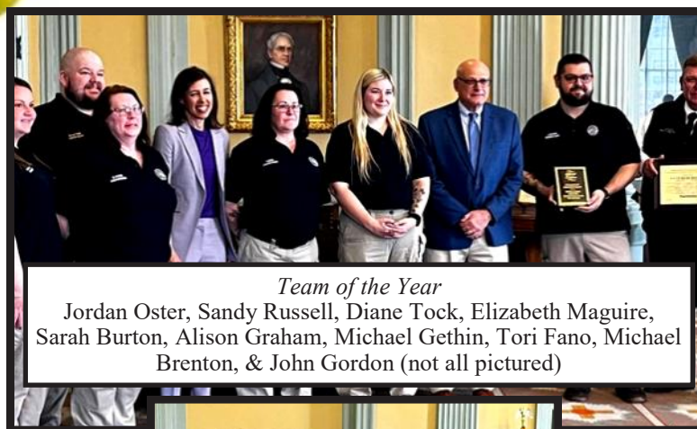
Team of the Year