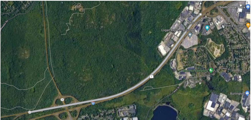
Bag Count for 93SB mile marker 6-4

Over a 5 year period an average of 4 bags were picked each time crews worked on that segment