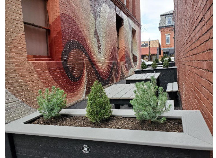
Shared Streets grant funding helped convert an alley in Melrose into an active, useable space