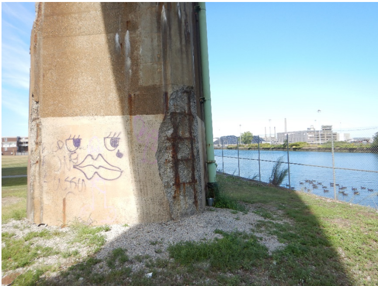
Deteriorated Concrete at base of Pier