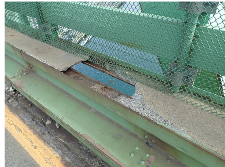
Typ. Deterioration of Concrete Safetywalk