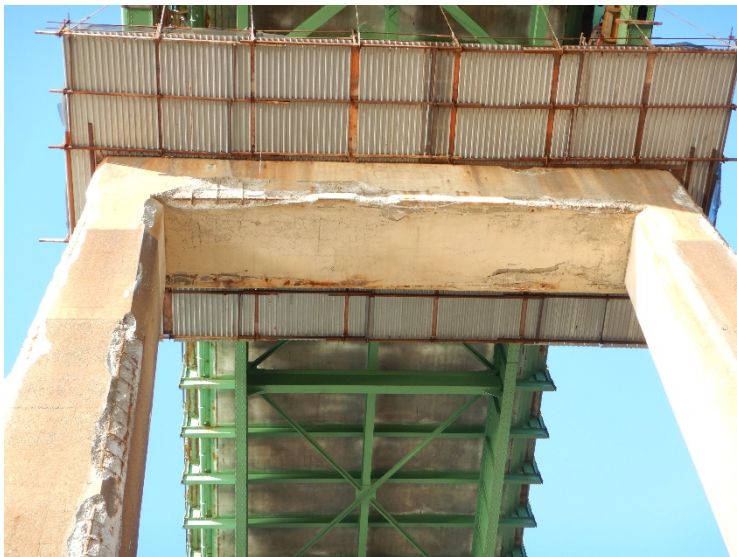
Typ. Deterioration of Main Piers