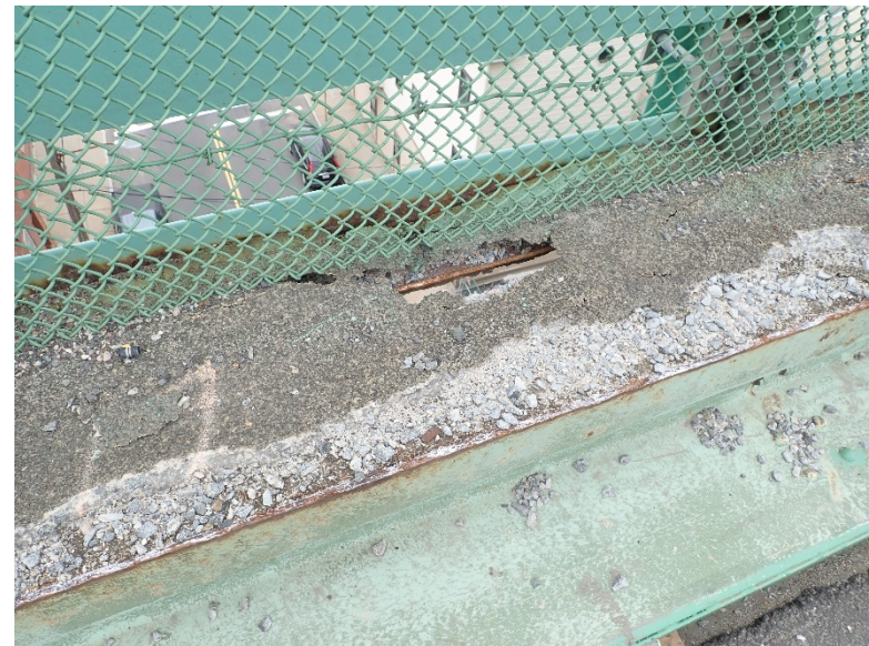
Deteriorated Safetywalk – Note Roadway Below