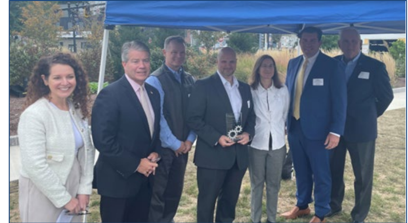
9/23: ACEC Engineering and Public Works Roadshow – East Milton