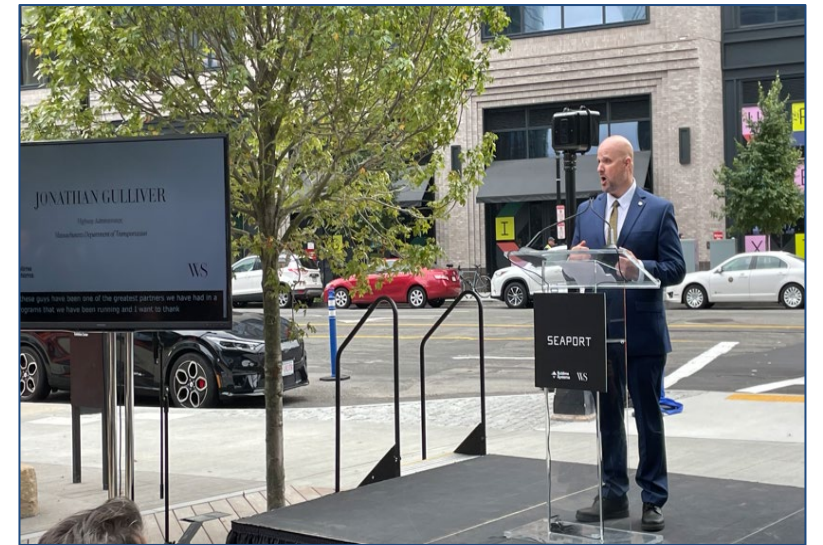
10/1: Sublime Ribbon Cutting