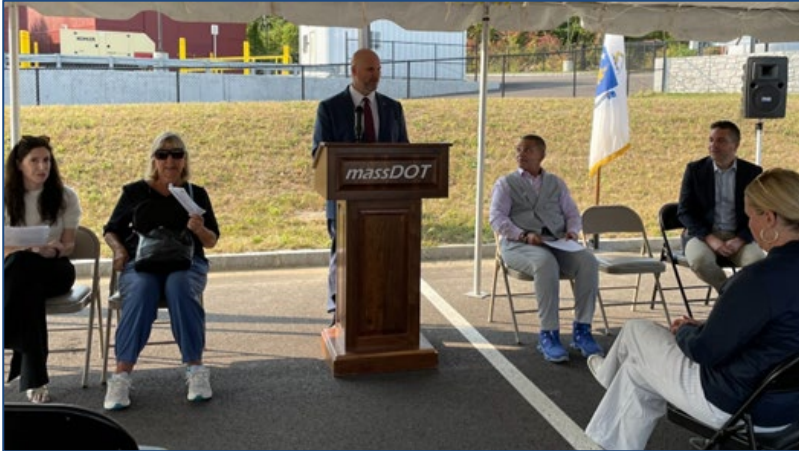
9/13: Framingham Park and Ride Ribbon Cutting