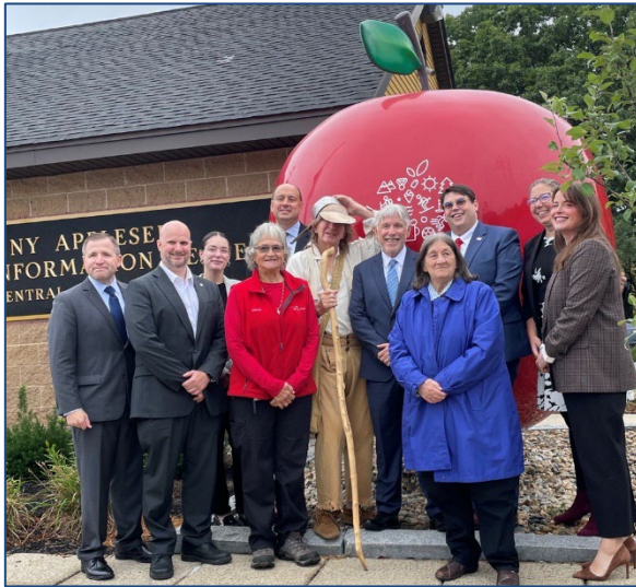
9/26: Johnny Appleseed 250th Anniversary