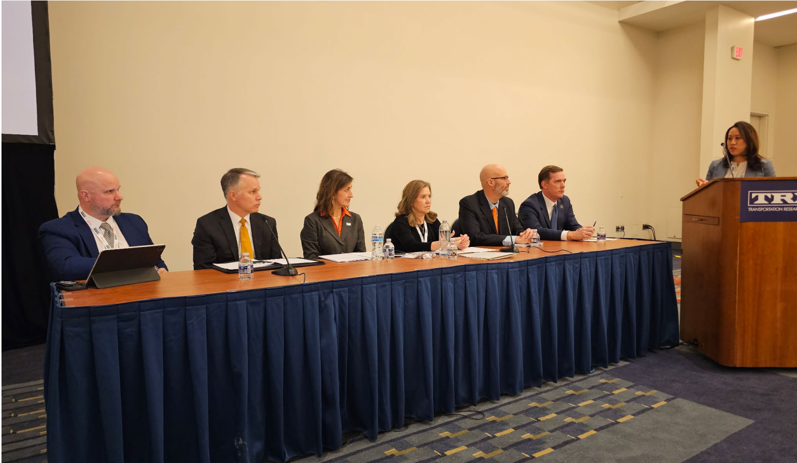
TRB Annual Meeting January 11-15, 2026