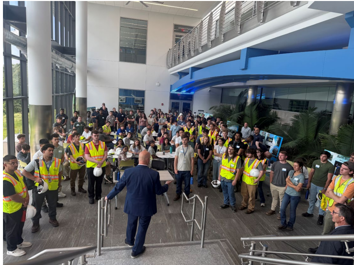
2026 Intern Program