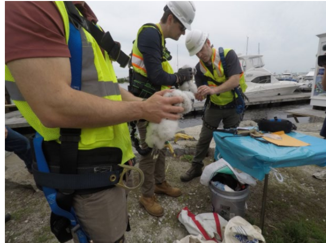
5/27/26: Peregrine Falcon banding Gillis Bridge, Newburyport