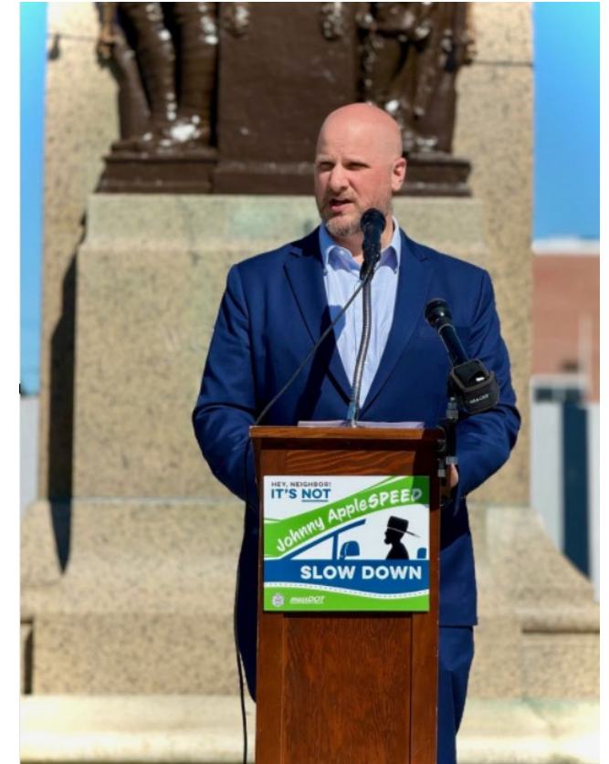
6/9: Leominster speed awareness campaign kickoff