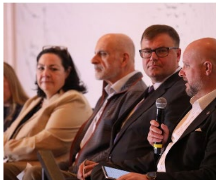
2026 NASTO conference on emergency preparedness