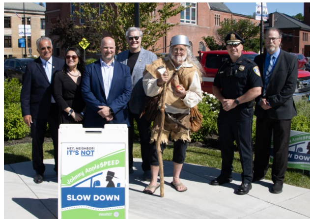
6/9: Leominster speed awareness campaign kickoff