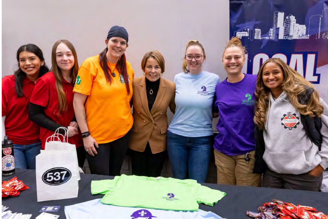
Governor Healey Celebrates Massachusetts Women and Girls in Trades Mass.gov/news/governor-healey-celebrates-massachusetts-women-and-girls-in-trades