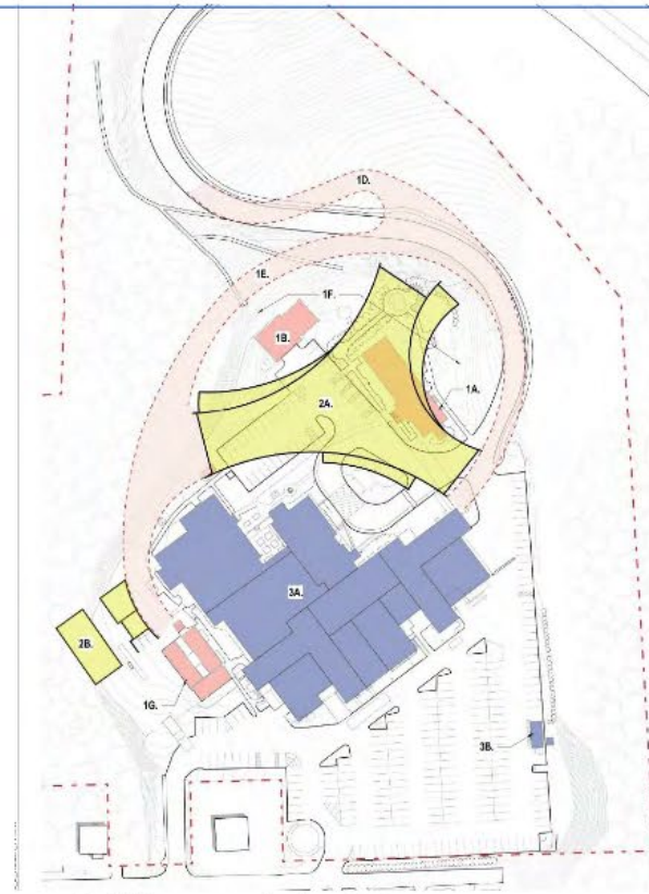
New building completion & Occupancy