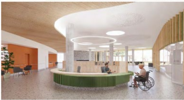
Main Lobby, Reception, Hobby Room