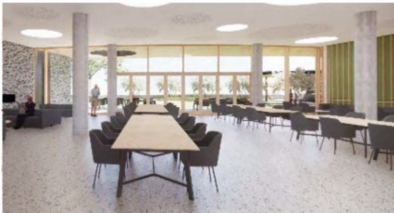
Great Room facing Holyoke Terrace and outdoor barbeque areas