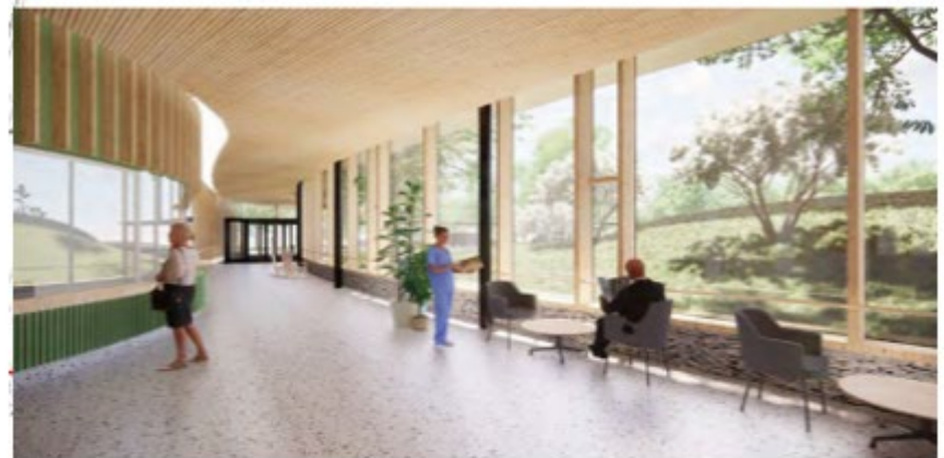
Entry Vestibule facing Greenhouse