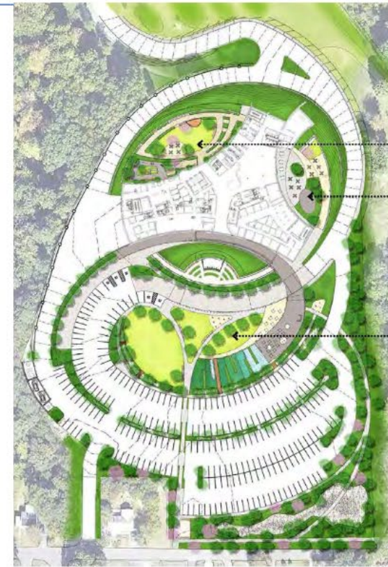
Existing Structure Demo & Site Work completion