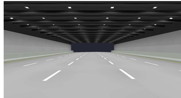
Example of SB Entrance Portal