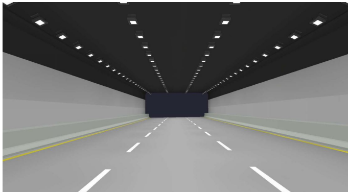
Example of Main Line