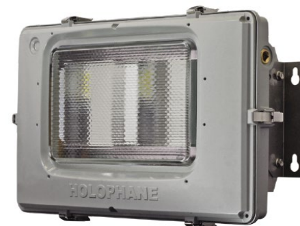
Typ. Proposed Fixture