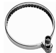
Meter Locking Stainless Steel Ring

Inner-Tite specializes in the manufacture of anti-theft devices used by electric, gas and water utilities to secure meters, cables, pipes and other equipment (see right). The company maintains a staff of approximately 85 employees at its Holden, MA facility, which it has occupied since 1987.