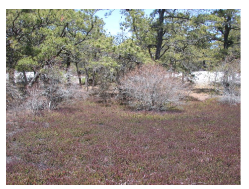
A cranberry swale early in the spring

Description: Interdunal Marsh/Swales (interdunal swales) form in barrier beach systems in low, shallow depressions between sand dunes. The best examples are complexes of multiple swales with varied conditions. Soils generally have a thin (1 cm) organic layer over coarse sand. The substrate may be seasonally flooded or permanently inundated, with water coming from groundwater and precipitation, with occasional brackish overwash from storms. The water regime controls the vegetation. The community is usually graminoid- or shrub-dominated, one variant has a pitch pine canopy.