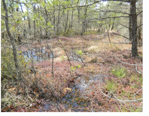
A wet swale with pitch pine.

Examples with Public Access: Several dune systems on public lands have trails and/or boardwalks that intersect interdunal swales. If visited, care should be taken not to create trails across the peat surface or in the easily damaged surrounding dunes. Cape Cod National Seashore, multiple areas; Parker River NWR, Newburyport, multiple areas; Sandy Neck (town), Barnstable; Demarest Lloyd SP, Dartmouth.