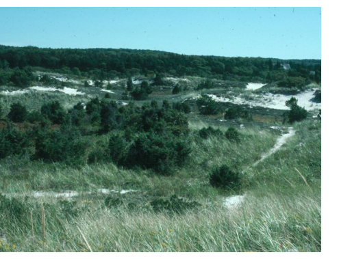
Interdunal swales with dense shrubs and worn trail around it.

Differentiating from Related Communities: Occurring in shallow, wet basins in dune systems is the defining characteristic of <u>Interdunal Marsh/Swales</u>. They are graminoid-, shrub-, or pitch pine dominated communities growing on shallow peat over sand. <u>Acidic Graminoid</u>