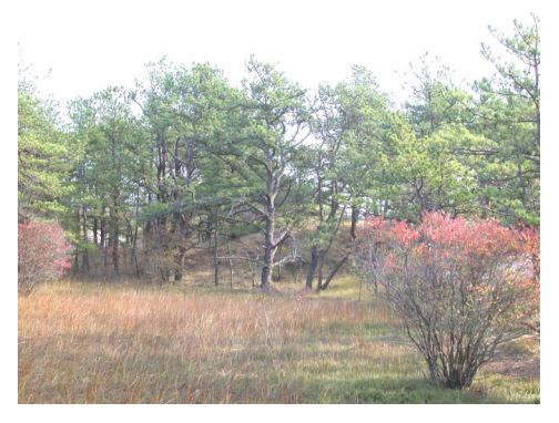
Interdunal swale with twig rush in pitch pines on dunes.