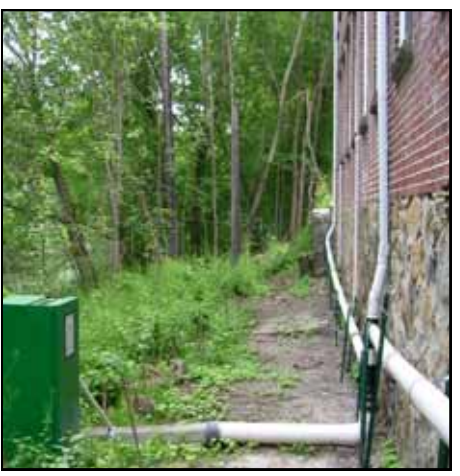
Water quality monitoring station below the green roof

DCR contracted with the U.S. Geological Survey (USGS) to compare the quality and the quantity of the stormwater running off the green roof to that running off the conventional rubber roof on the adjacent building, Ipswich Town Hall. Both the green roof and the Ipswich Town Hall roof were fitted with flow gauges (to measure the rate and volume of runoff) and water quality samplers (to collect runoff for chemical analysis). A rain gauge was also installed on the Ipswich Town Hall roof to collect rainfall and keep track of total rainfall amounts. Rainfall and runoff from the two roofs were monitored for 18 months over 2007 and 2008. In all, 70 storms were analyzed for runoff volume, and 5 storms were analyzed for water quality. Contaminants investigated included nitrogen and phosphorus compounds and heavy metals.