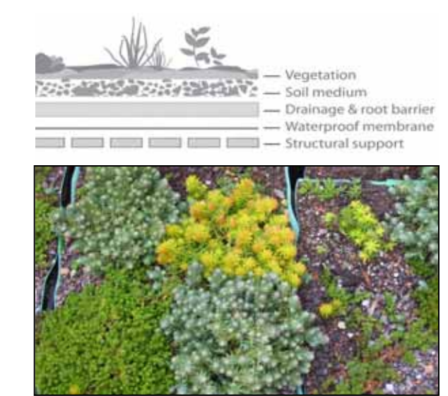
Dominated by succulent Sedums, green roofs need very little water or fertilizer and can survive temperature extremes.

A green roof is a rooftop that is covered with plants. Most green roofs involve a layered system that commonly includes (from bottom to top): a waterproof membrane; a drainage layer and root barrier; lightweight soil; and hardy, drought-resistant plants. Different types of green roofs may be chosen, depending on the steepness of the roof, the building's ability to sustain the added weight, the primary purpose of the green roof, and the maintenance requirements of the plants. Plantings can include trees and shrubs, especially where the green roof is intended to be used as garden space, but more often lighter-weight and lowermaintenance plants - such as Sedums, grasses, and mosses - are selected because they are drought tolerant, able to grow in shallower soil depths, and do well in sunny locations.