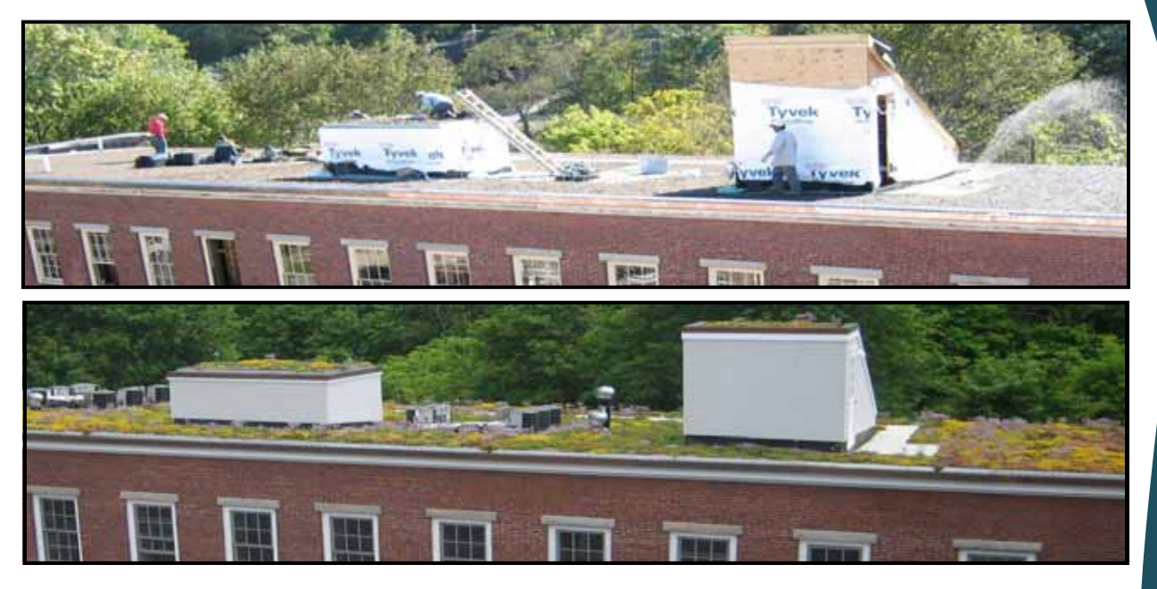
The case-study green roof was constructed in September 2006 on an existing roof (top) and is home to at least 10 species of flowering plants (bottom). The roof area is 3,000 ft^2 and the weight is 20 lbs. per ft^2 (saturated).