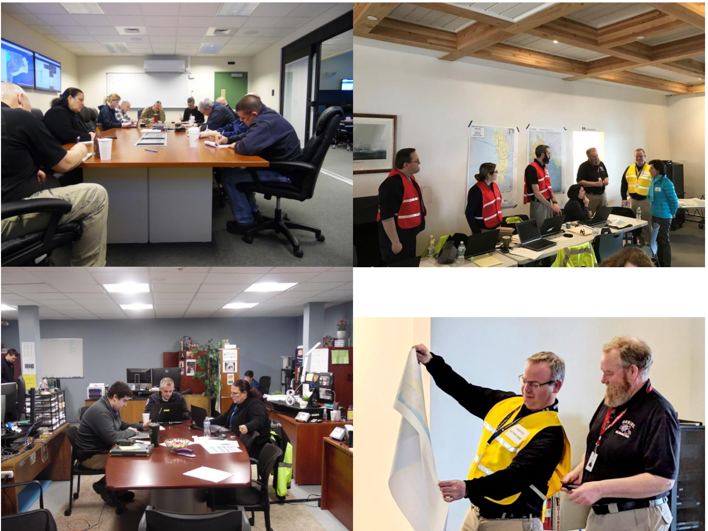
MEMA Staff and NWMIMT Deployed in Rhode Island

The request for assistance from the Rhode Island Emergency Management Agency was made directly to MEMA and was facilitated through the Emergency Management Assistance Compact (EMAC), which is the national emergency management mutual aid system that facilitates state-to-state disaster assistance. In 2018, MEMA deployed staff to Florida, Puerto Rico, North Carolina, Virginia, Hawaii and FEMA Headquarters to assist in the aftermath of natural disasters, and is proud to continue to support this tradition of providing aid to others in need.