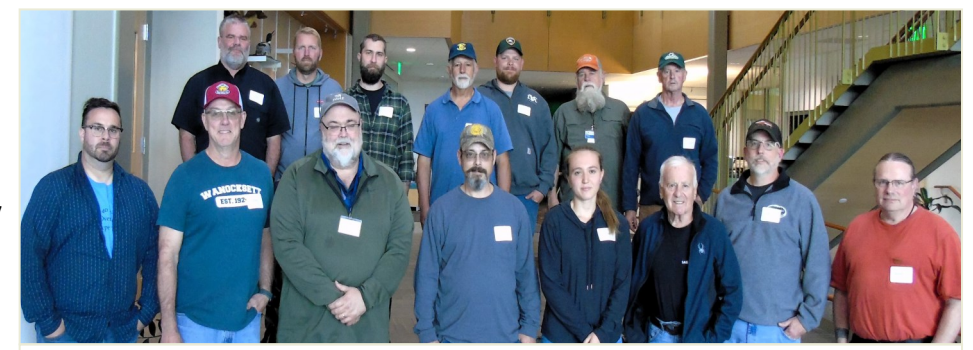
Fifteen volunteers attended the Bowhunter Ed Workshop and are ready to teach courses

The event on May 31<sup>st</sup> covered both conditions. In addition to participating as students, attendees received direction about the course, copies of the course lesson binder, and curriculum requirements. At the end of the day, 15 participants completed the training to become New Bowhunter Education instructors.