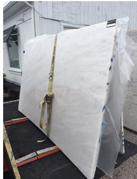
Figure 4 – The marble slab involved in the incident.