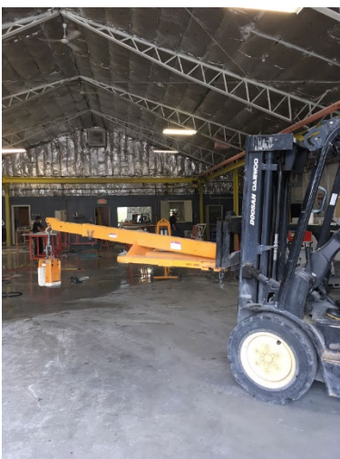
Figure 1 – The forklift inside the shop with the boom and slab lifter attached.

The telescoping boom attachment consisted of two rectangular steel tube sections. Specifications from the manufacturer indicated the boom weighed 286 pounds, had a maximum rated load capacity of 3,300 pounds when fully retracted, and a maximum load capacity of 1,320 pounds when fully extended. The telescoping range of the boom was from approximately 6.8 feet to 11.7 feet in three increments of 19 inches. The boom could only be extended manually and had a series of pins and clips to hold it in position. The boom attached to the forklift by sliding onto the forklift tines and was secured by two bolts and two restraint pins (Figure 1).