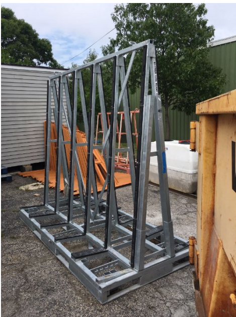
Figure 3 - A-frame rack involved in the incident without the caster wheels attached and the safety posts not installed.

An A-frame rack was in use at the time of the incident and was designed to hold slabs in a range of sizes (Figure 3). The rack was equipped with removable caster wheels that were in place at the time of the incident. The caster wheels consisted of 8-inch diameter roller bearing wheels that were rated at 2,000 pounds each. Two of the four wheels were swivel casters with brakes and the other two wheels were rigid. The rack's rated capacity was 8,000 pounds, 4,000 pounds for each side of the rack with the installed wheels (it had a 10,000 pound capacity, 5,000 pounds per side, without the optional wheels installed). The rack was equipped with four hold-down ratchet straps to secure the slabs being stored on the rack. It was also equipped with four safety posts, two for each side, to prevent a slab from tipping off the rack and provide safe access of unstrapped loads that may shift unexpectedly. The rack was 96 inches long by 28 inches wide and 99 inches high (88 inches high without the optional caster wheels).