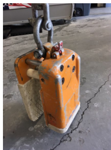
Figure 2 – The slab lifter.