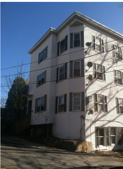
10 Wells Court, now demolished