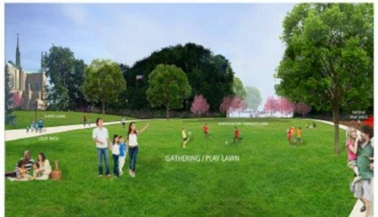
PROPOSED IMPROVEMENTS AT GATHERING / PLAY LAWN