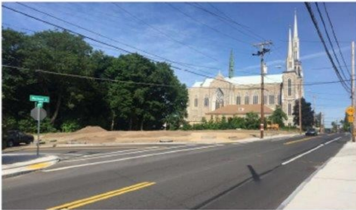
EXISTING CONDITIONS AT MECHANIC STREET PARK GATEWAY

A. T. LEONARD & ASSOCIATES LANDSCAPE ARCHITECTURE PLANNING