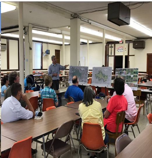
PARC grant public hearing