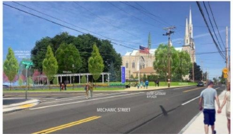
PROPOSED IMPROVEMENTS AT MECHANIC STREET PARK GATEWAY