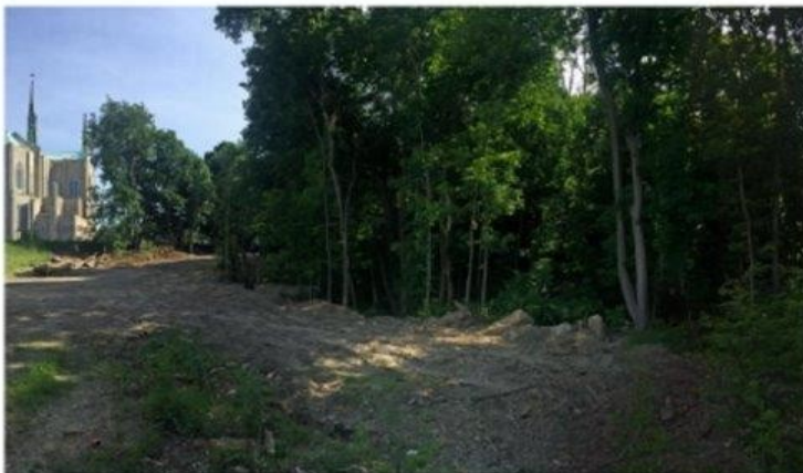
EXISTING CONDITIONS AT GATHERING / PLAY LAWN