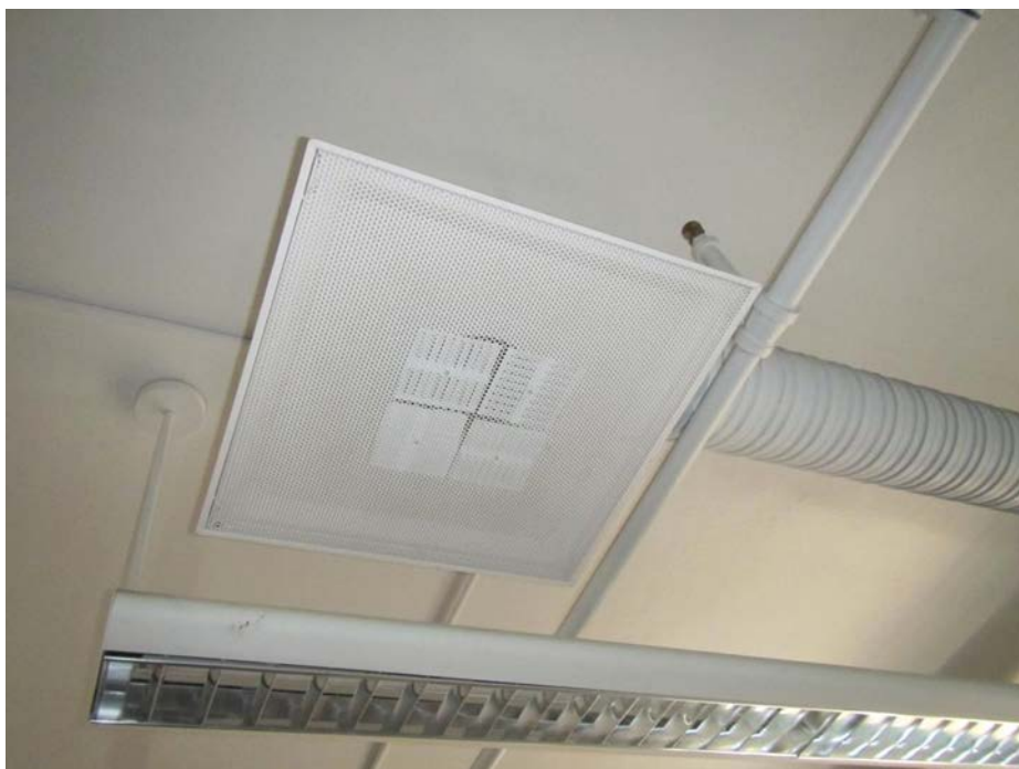
Classroom supply air vent