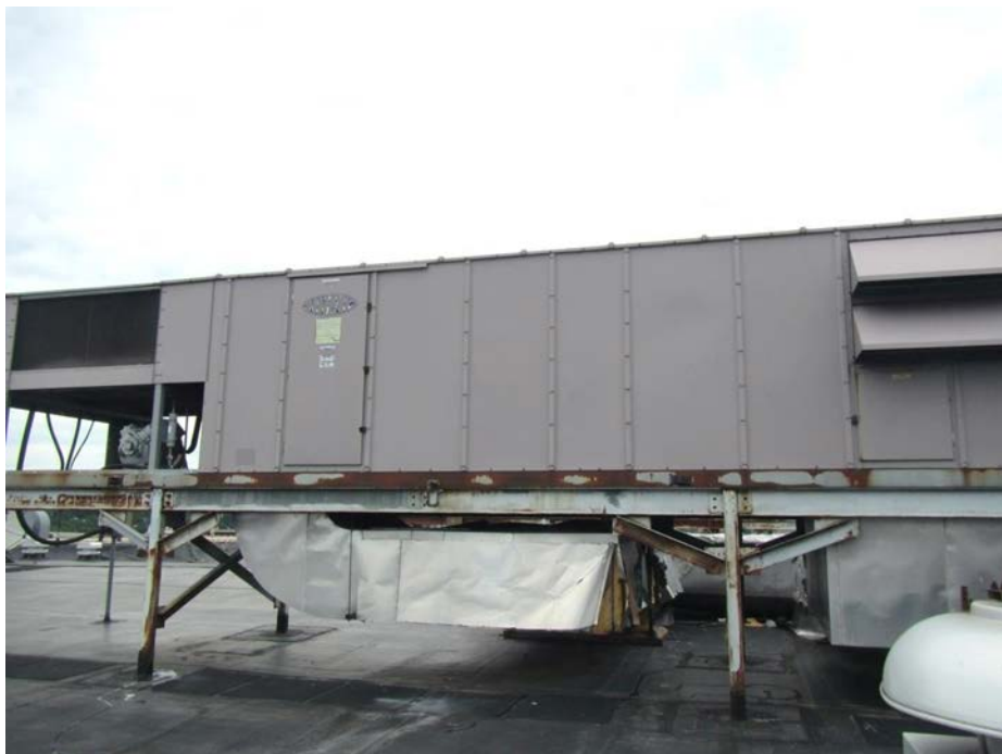
“Packaged” AHU on roof