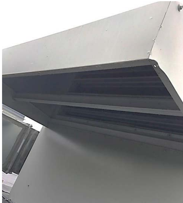
Rooftop fresh air intake lacking bird screen/pre-filter