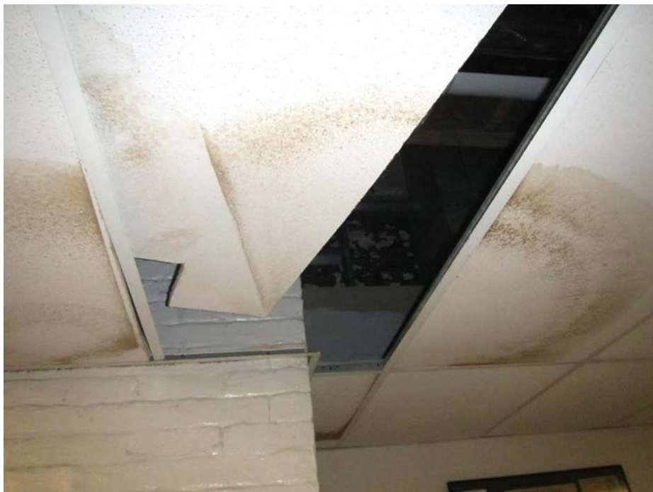
Missing ceiling tiles