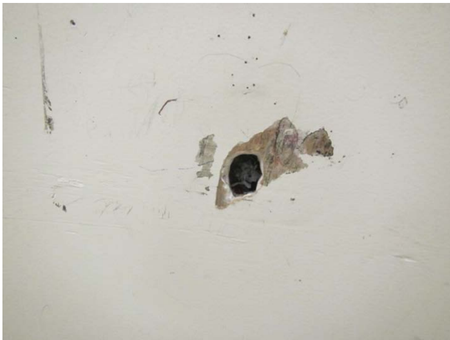
Water-damaged/mold-colonized gypsum wallboard