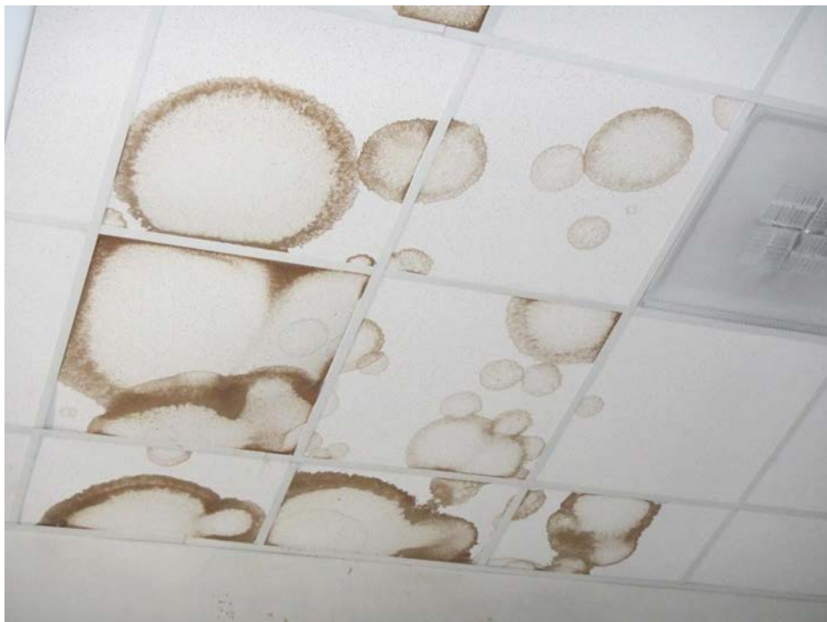
Water-damaged ceiling tiles