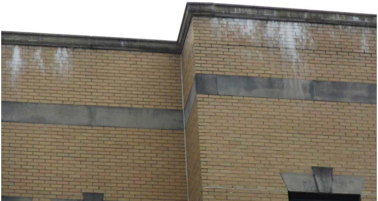
Efflorescence in brickwork near roof edge