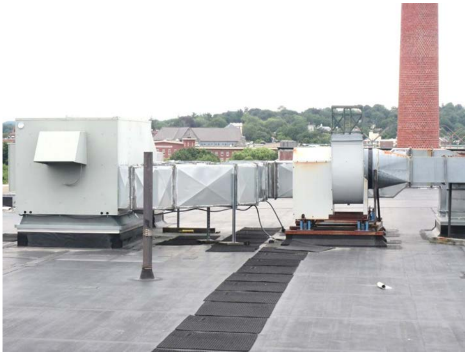
AHU on roof