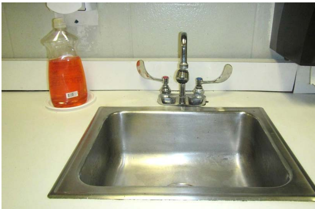
Backsplash behind sink lacking caulking