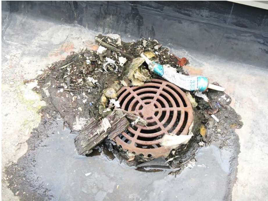
Debris around roof drain