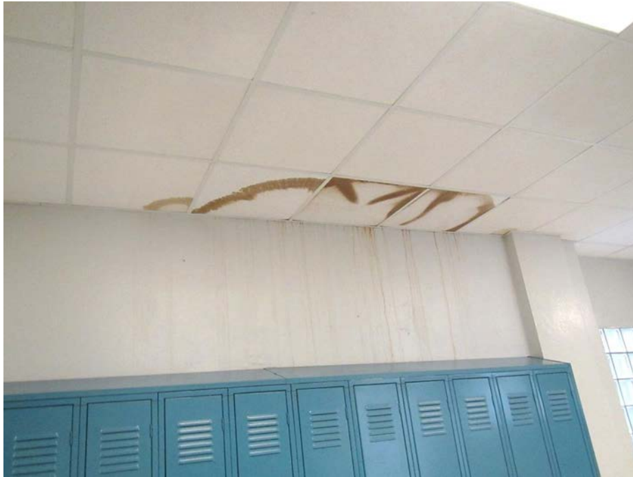
Water-damaged ceiling tiles