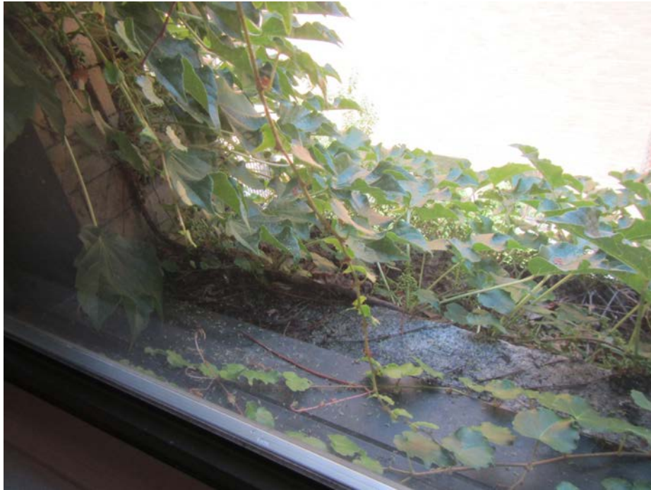
Vegetation against exterior of building