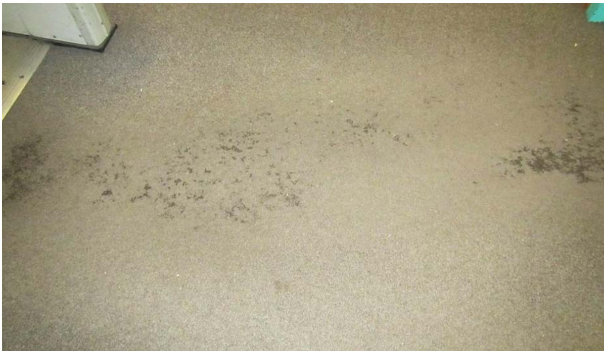
Stained, worn carpeting