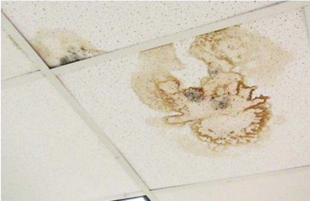
Water-damaged/mold-colonized ceiling tiles