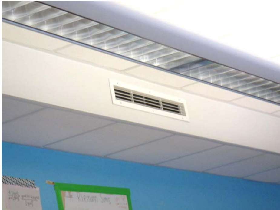
Classroom supply vent