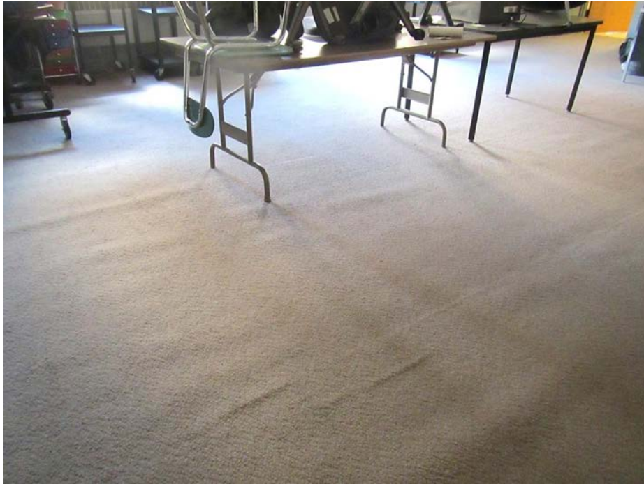
Worn, wrinkled carpeting