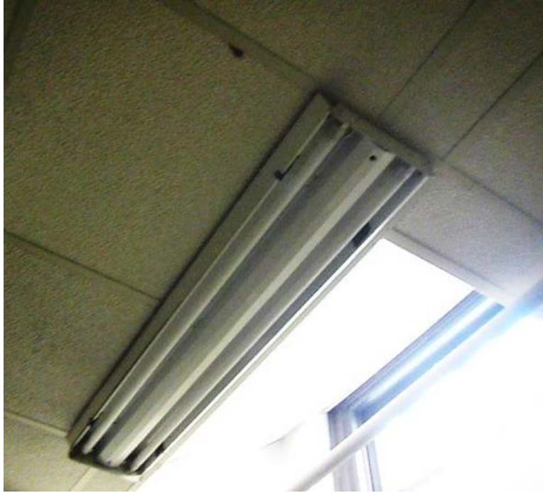
Missing light cover