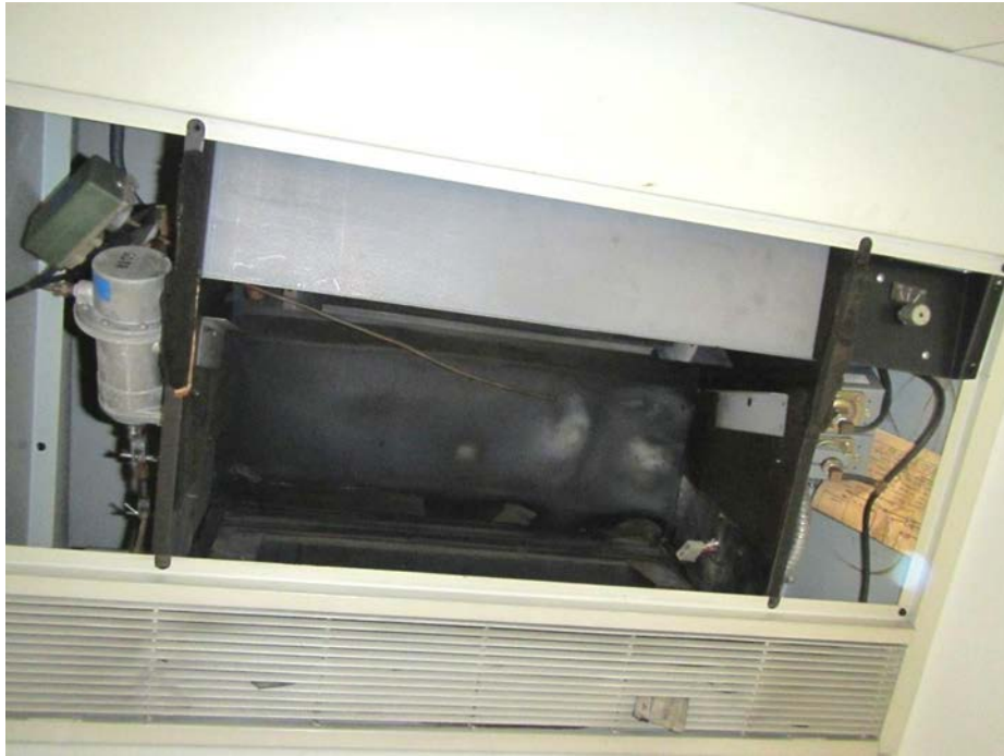
Ceiling-mounted fan coil unit in disrepair