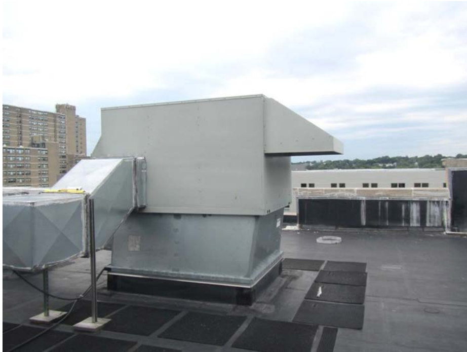
Air handling unit (AHU) on the roof