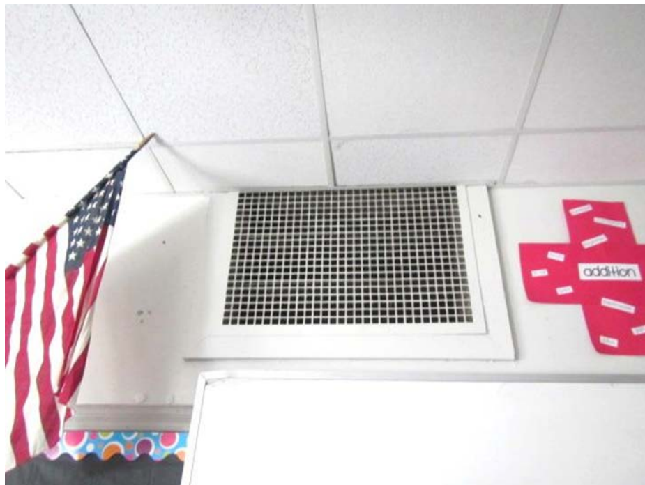
Exhaust/return vent in classroom