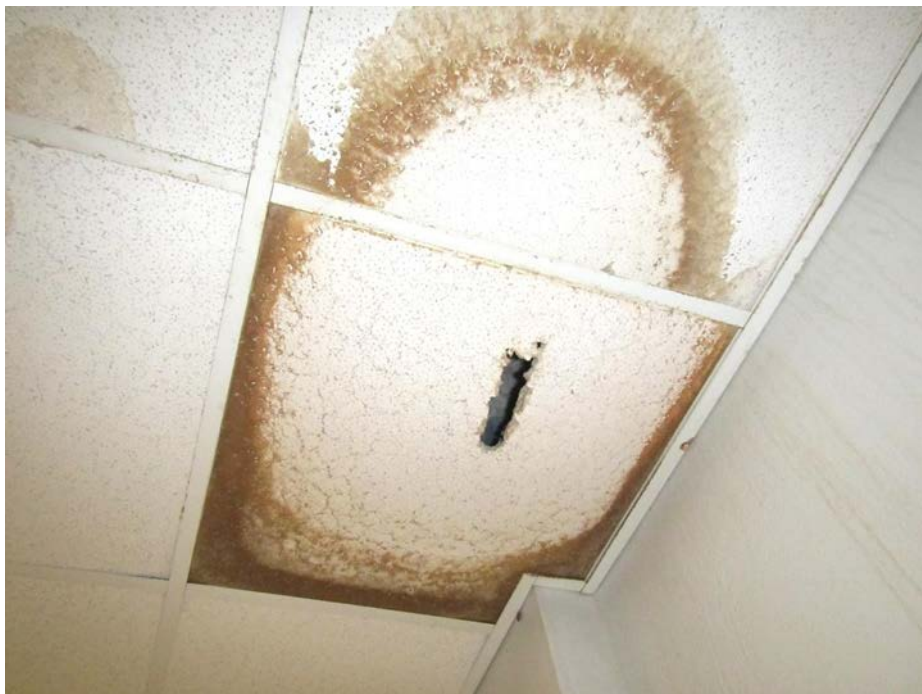
Water-damaged ceiling tiles