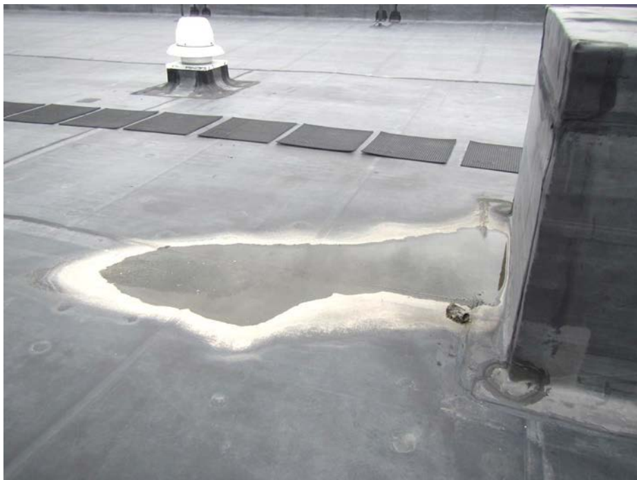
Water pooling on roof