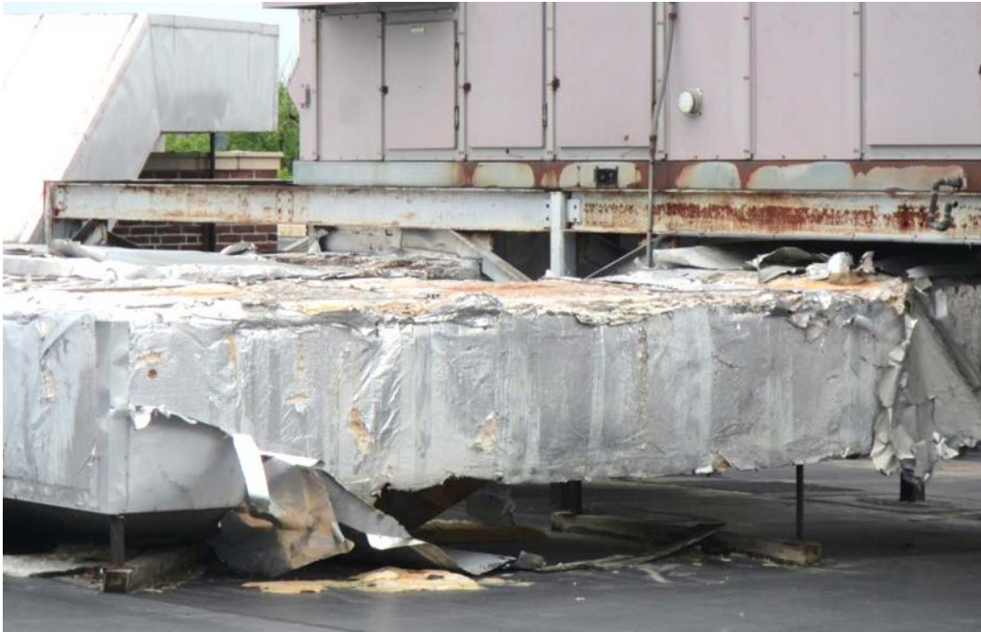
Deteriorated exterior duct insulation