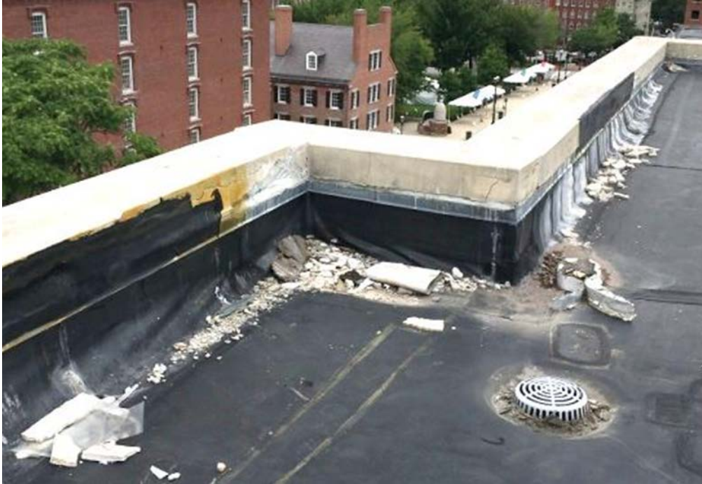
Evidence of spalling parapet and efflorescence