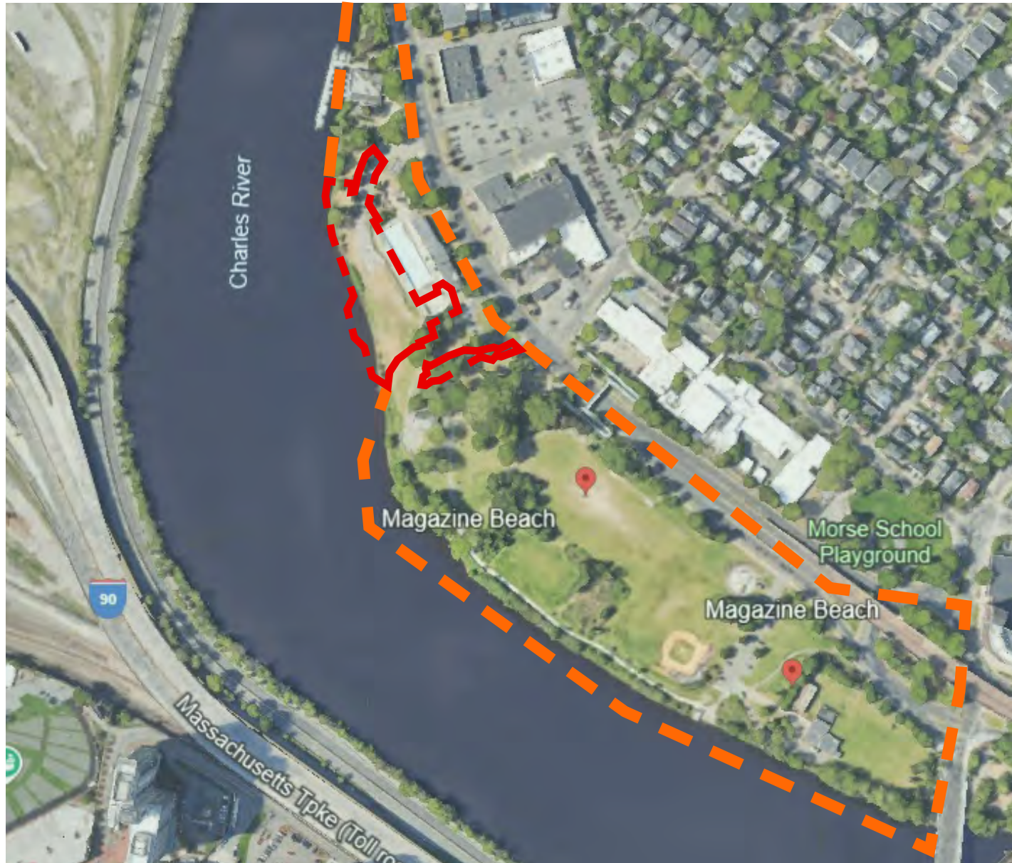
Magazine Beach: Overall Park Aerial