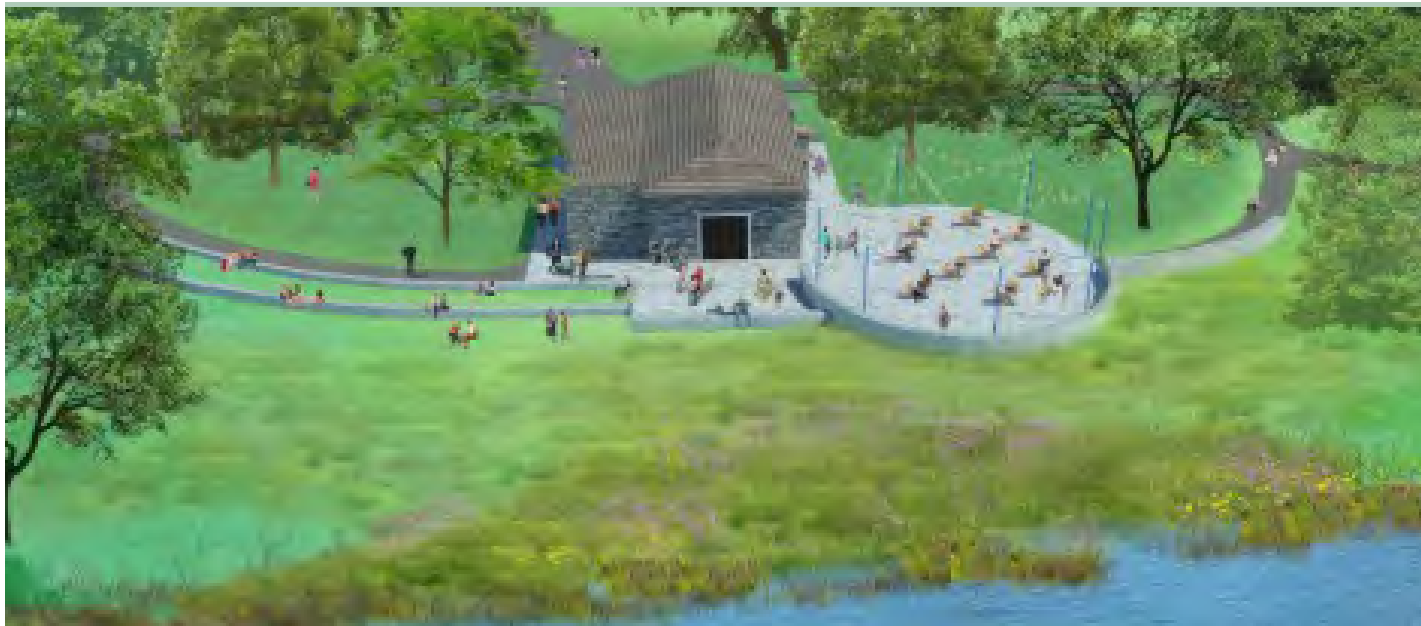
Rendered Image: Phase 2.1 Powder Magazine Improvements