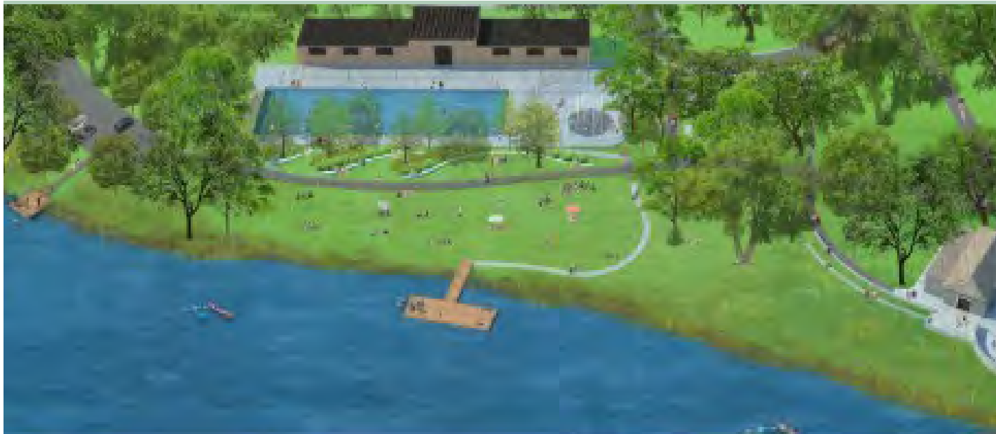
Rendered Image: Phase 2.2 Grassy Beach Improvements