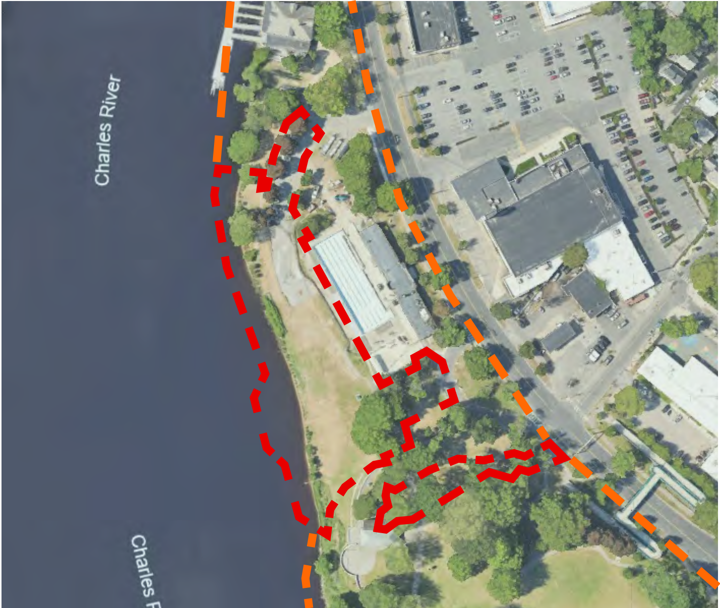
Magazine Beach: Phase 2.2 Limit of Work