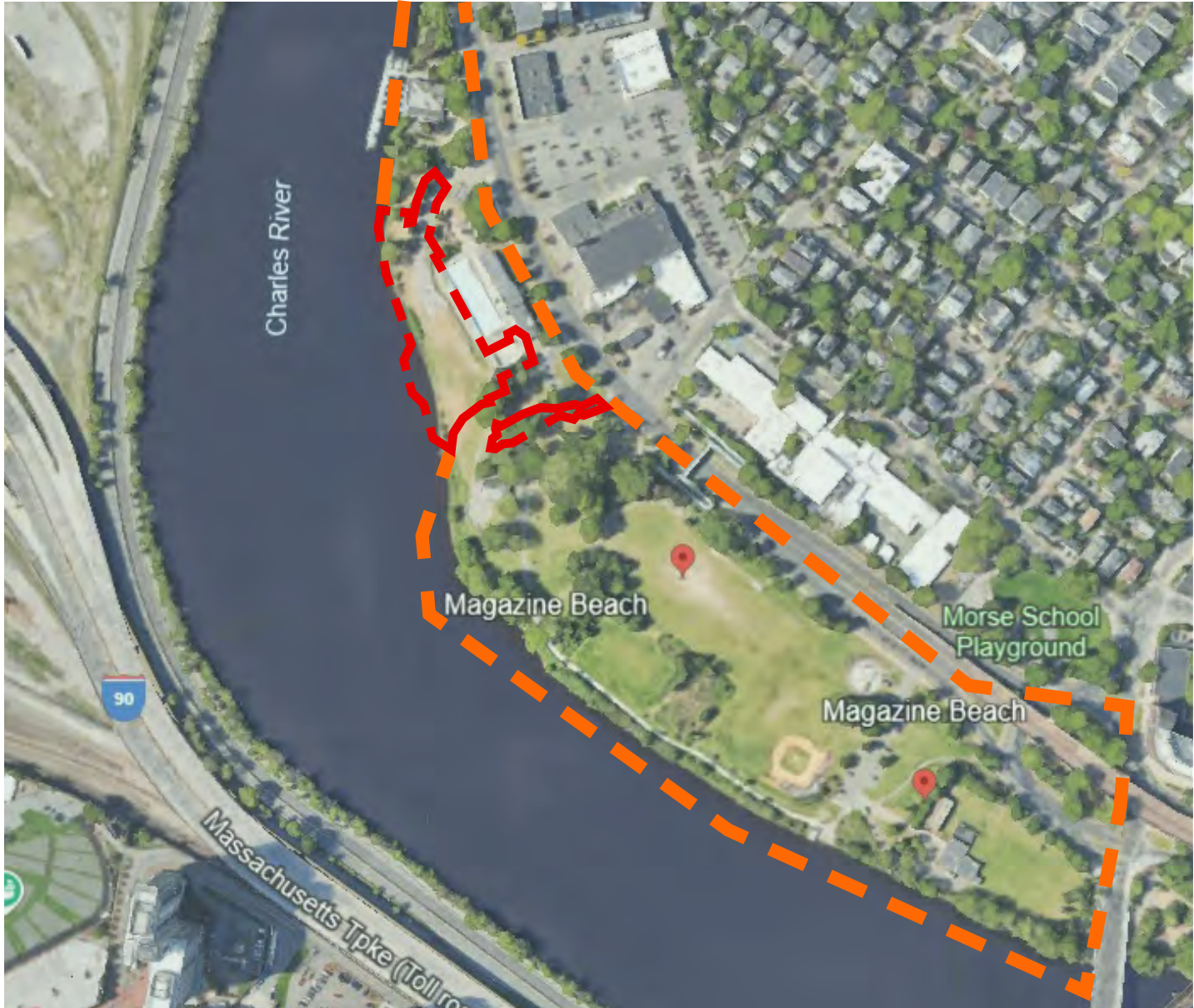
Magazine Beach: Overall Park Aerial