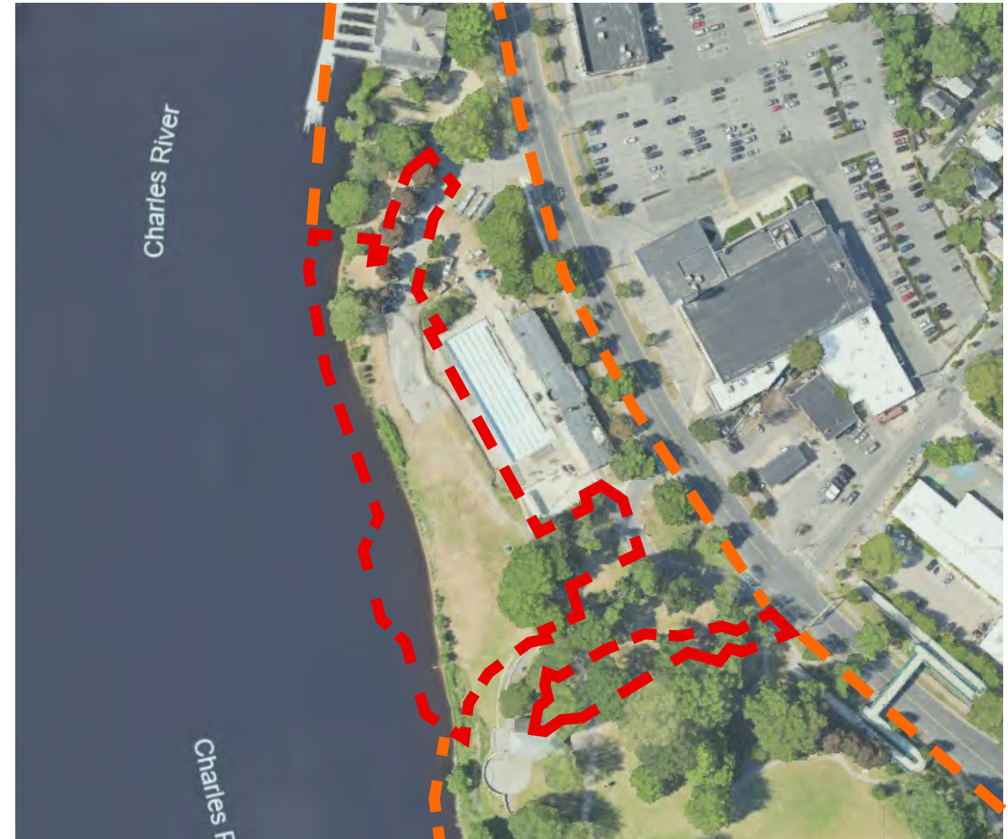
Magazine Beach: Phase 2.2 Limit of Work