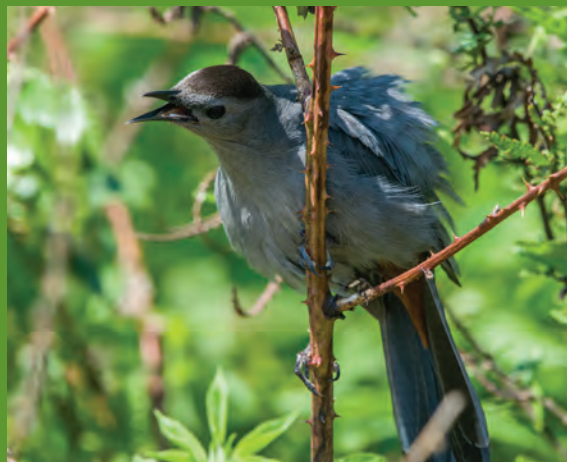
Gray Catbird on Common Blackberry