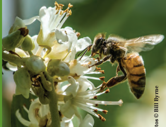
Honeybee on Sweet Pepperbush