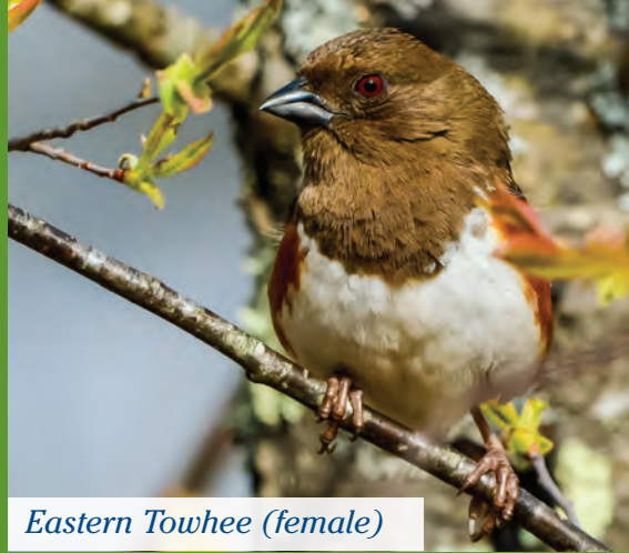
Eastern Towhee (female)

Our forester was outstanding to work with. He truly understood and shared our goals and found a local logger who treated our property with respect. When the operation was in full swing the market for higher quality oak was down, so we elected to retain the trees that had been marked as saw logs. To compensate, and remove the total volume of wood we were seeking, we added another 20 cords to the total amount of firewood to be harvested, resulting in 175 cords coming off the property. While 175 cords may sound