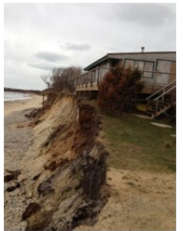
An actively eroding sand cliff.

Description: The Maritime Erosional Cliff Community occurs on cliffs being actively eroded by the sea - storms particularly cause dramatic changes. The seaward-facing unconsolidated cliff faces above beach strand communities are in the salt spray zone where wind and salt spray constantly dry the vegetation. The cliffs themselves may be glacial deposits best developed on terminal moraines usually with mixed material - boulders, gravel, sand, and lenses of clay. There are also cliffs of sand from glacial outwash or dunes. The unconsolidated cliff material generally does not hold water, which combined with the wind, produces a very dry environment. Freshwater flowing through the cliff material may emerge as seepage at the base. With the constant erosion there is little soil development on the cliff face. Maritime Erosional Cliffs may be 100 ft. (~33m) or more high above the ocean and beach below.