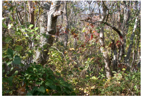
Greenbrier on oaks inside a Maritime Forest/ Woodland.

limited to those with deep delving root systems. While sandy soils are generally low in nutrients, these soils may have higher nutrient levels than expected due to the accumulation of leaf litter, fragments of sea shells, and input from salt spray (which in the extreme, can produce conditions too salty for many plants).