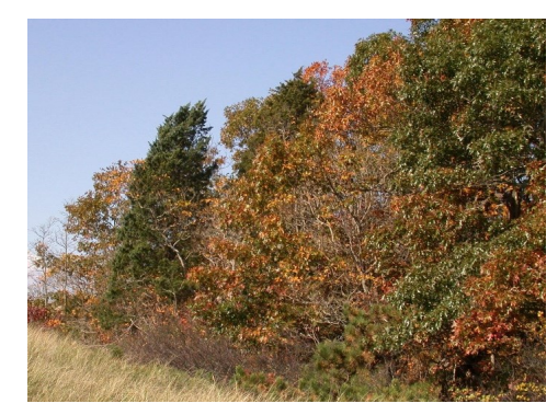
Dense edge of an oak dominated Maritime Forest/Woodland in dunes.