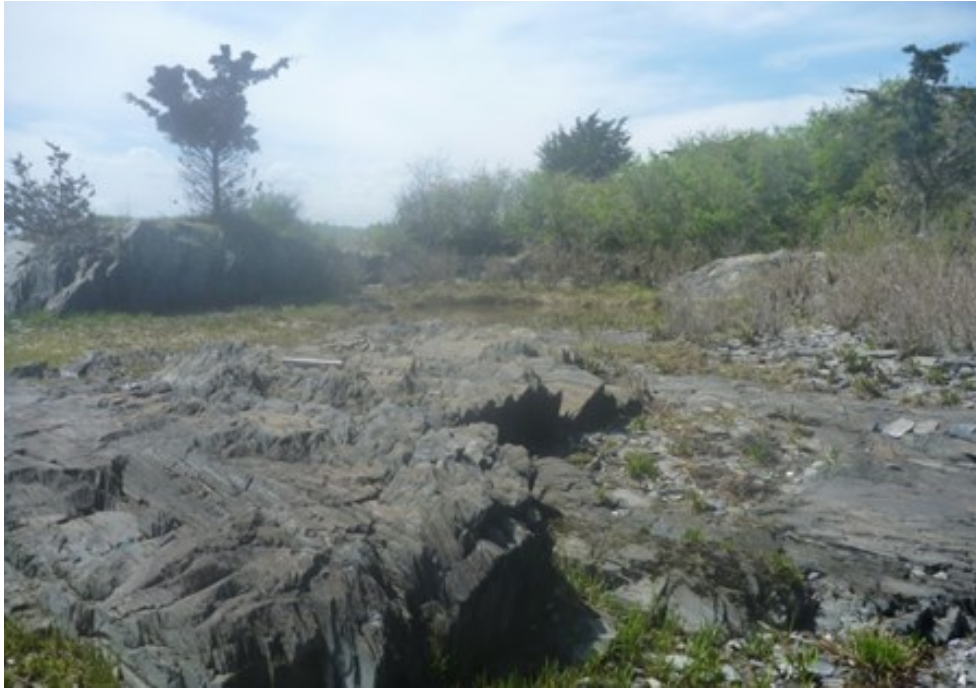
Maritime Rock Cliff. Slate Island, Boston Harbor Islands National and State Park.

Description: Maritime Rock Cliff Communities occur on the ocean side of rocky headlands and coastal bedrock outcrops, above the rocky intertidal, but within the salt spray zone where they are very exposed to storms. Vegetation grows in small pockets where the soil is augmented by droppings from gulls, cormorants, and other cliff perching birds.