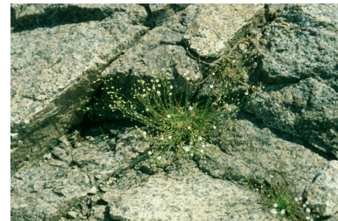
Knotted pearlwort, growing in the cracks of a Maritime Rock Cliff.