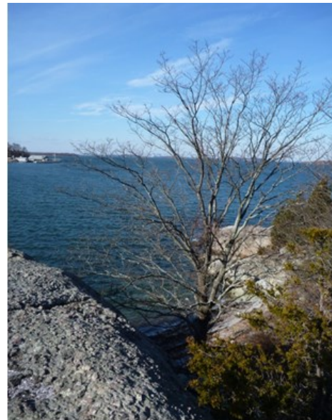
Maritime Rock Cliff, Boston Harbor Islands.

Maritime Rock Cliffs are sensitive to visitation - care should be taken not to disturb plants during a visit. Slate Island, Boston Harbor Islands, Weymouth.