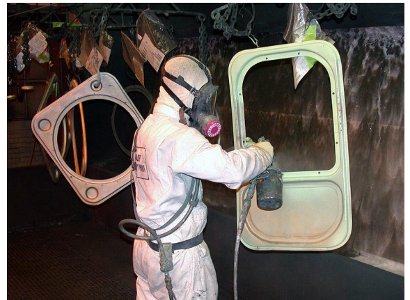
An example of a supplied air respirator

Paint technicians must wear eye protection such as safety glasses, goggles or a hooded or full face-piece respirator when working with paints and solvents [29 CFR 1910.133(a)(1)].