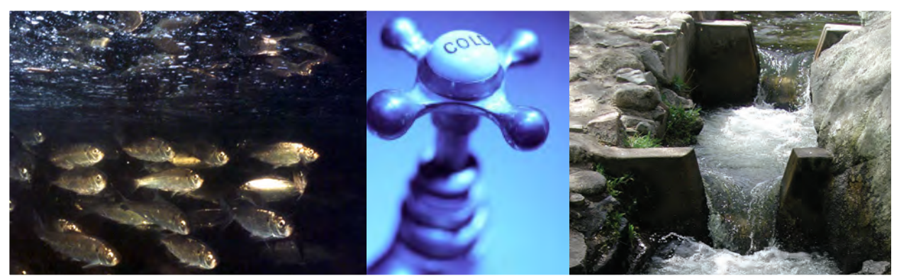
New Water Management Act regulations utilize a transparent, predictable and science-based approach that provides water for both economic development and environmental sustainability.

For more information on the Water Management Act program including the new regulations, go to: http://www.mass.gov/eea/agencies/massdep/water/ watersheds/water-management-act-program.html