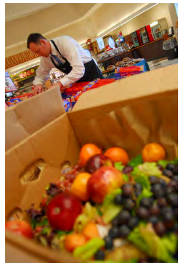
Culling food at a supermarket.

October 1, 2014, marked the official start of the Commonwealth's first-in-the-nation ban on the disposal of commercial organic wastes by businesses that dispose of one ton or more of organics per week. The disposal ban affects approximately 1,700 businesses and institutions, including supermarkets, colleges and universities, hotels, convention centers, hospitals and nursing homes, large restaurants, and food service and processing companies. It does not affect residences. This ban will divert 450,000 tons of food waste a year from landfills and incinerators and direct it to composting facilities or anaerobic digesters which produce renewable fuel from the material. This initiative will reduce waste; cut disposal costs for businesses and institutions; reduce emissions from fossil fuel use; re-purpose food for food banks and fertilizer; and stimulate the green economy.