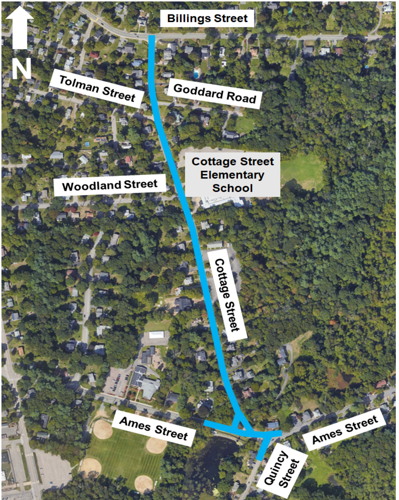
LCOUS MAP (PROJECT AREA) Cottage Street Sidewalk Improvements (SRTS) Sharon, MA