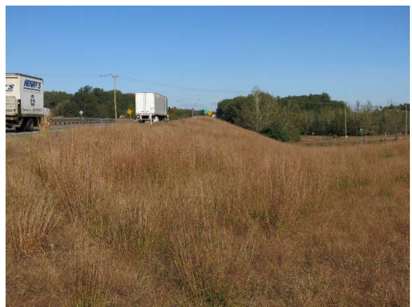
Photo 4: Little bluestem grassland provides a low-growing stable plant community. Vegetation management strategies should seek to promote this vegetation.

The management objective in this zone is to maintain and preserve a self-sustaining plant community that provides screening and a physical buffer of the roadway for abutters; a continuous green corridor for roadway users; a protective buffer for rivers, wetlands and water bodies; a natural means of managing stormwater; and habitat for wildlife.