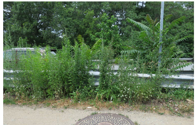
Photo 2 – Rapid re-growth or re-sprouting of mugwort and tree-of-heaven in median guardrail creates visibility and structural problems and is unsightly.

Problematic plants in Zone I consist primarily of annual and perennial weeds growing in pavement cracks, along curbs, and in median barriers, and a variety of species behind the guardrail. Mugwort is particularly problematic along the guardrail as it is highly prevalent, difficult to eradicate, blocks visibility and is unsightly (Photos 1 and 2). Invasive species that re-sprout or spread following cutting, such as Oriental bittersweet, knotweed, black locust, and tree-of-heaven, are problematic along or behind the guardrail (Photo 2). Oriental bittersweet is particularly problematic on bridge abutments, fences, and utility poles, and along structures where access for cutting can be difficult. Poison ivy is problematic on guardrails and when it blocks accessibility of sidewalks forcing pedestrians into the roadway (Photo 3).