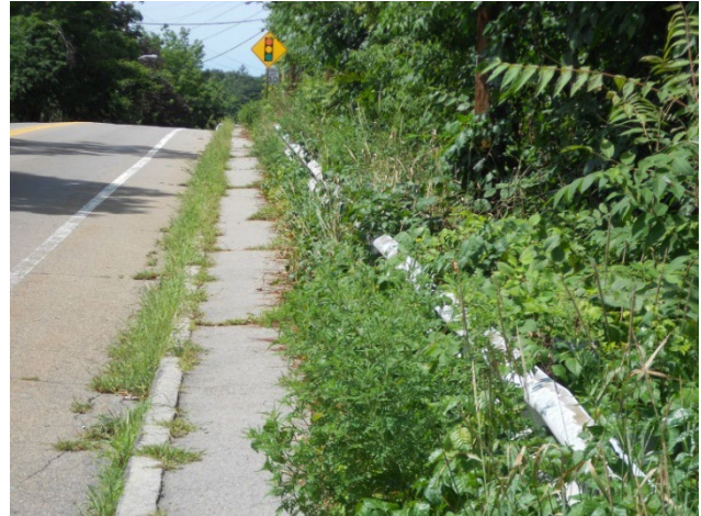
Photo 3 – Poison ivy, Japanese knotweed and other weeds block accessibility and visibility along a sidewalk.

Desirable vegetation in Zone II is a stable plant community that resists invasion by trees and invasive weeds. An example of a stable plant community is the little bluestem grasslands that are typical along many Massachusetts roadsides when not mowed (see Photo 4). Creating and preserving stable roadside vegetation will not only reduce maintenance over time, but will also improve stormwater infiltration and control, provide better habitat, and result in a more scenic roadside appearance. For most Zone II locations grass, non-invasive herbaceous species and low shrubs are desired vegetation.