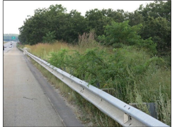
Photo 5- Switchgrass behind guardrail in this location does not require management as it does not pose a safety concern. Targeted herbicide treatment could be used to eradicate problematic plants such as black locust.

As part of its treatment strategy, District 3 will incorporate IVM principles. IVM is typically defined as the practice of controlling vegetation and, where appropriate, promoting desirable, stable plant communities through a combination of methods that take into consideration the need for control, cost-effectiveness, environmental protection, and regulatory compliance. For roadside management, each Zone has a different objective and therefore a different approach to IVM may be used in each Zone.