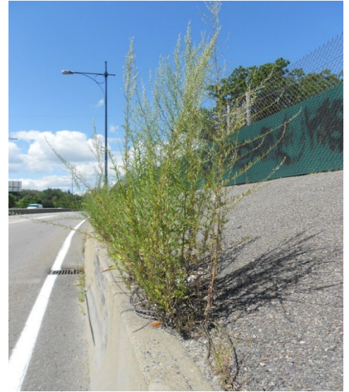
Photo 1 – Mugwort in difficult to access median blocks sight distances and leads to structural degradation.

The management objective for under and behind the guardrail is to maintain visibility of the guardrail and roadway signage and to preserve the integrity of the infrastructure. Vegetation that is low-growing or contained such that it does not interfere with visibility and is not unsightly is acceptable. Guardrail vegetation is typically cut low or would be sprayed up to three feet back from the curb. For double-faced guardrail in the median, spraying would typically be a four-foot swath, two feet on each side.