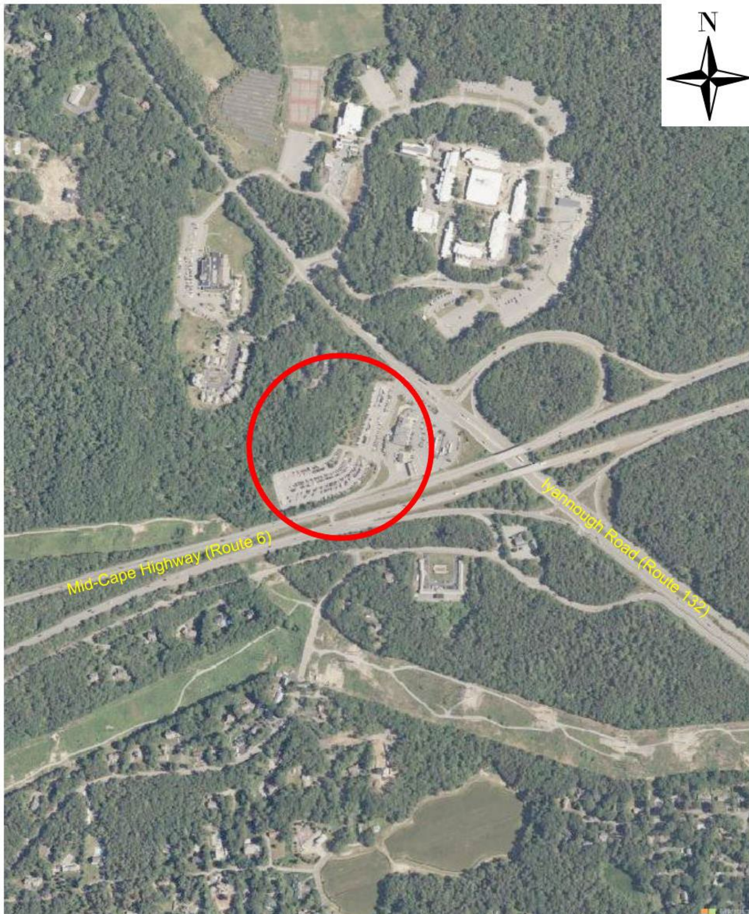
Figure 1 - Locus Map Park and Ride Barnstable, MA