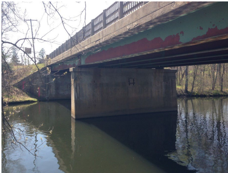
EXISTING BRIDGE ELEVATION VIEW