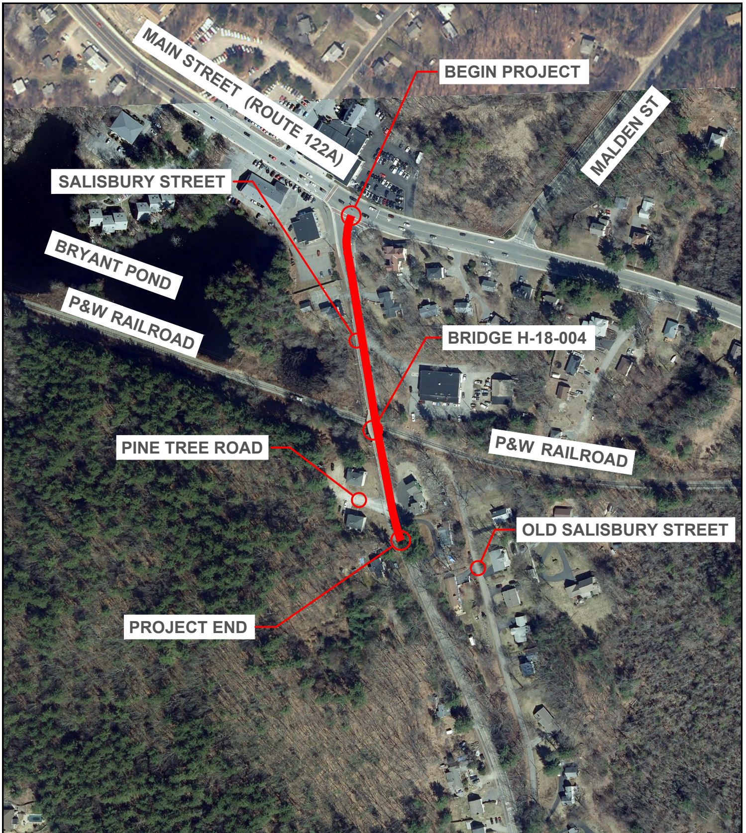
Figure 2 - AERIAL LOCATION MAP HOLDEN - BRIDGE REPLACEMENT, H-18-004 SALISBURY STREET OVER P&W RAILROAD HOLDEN, MA