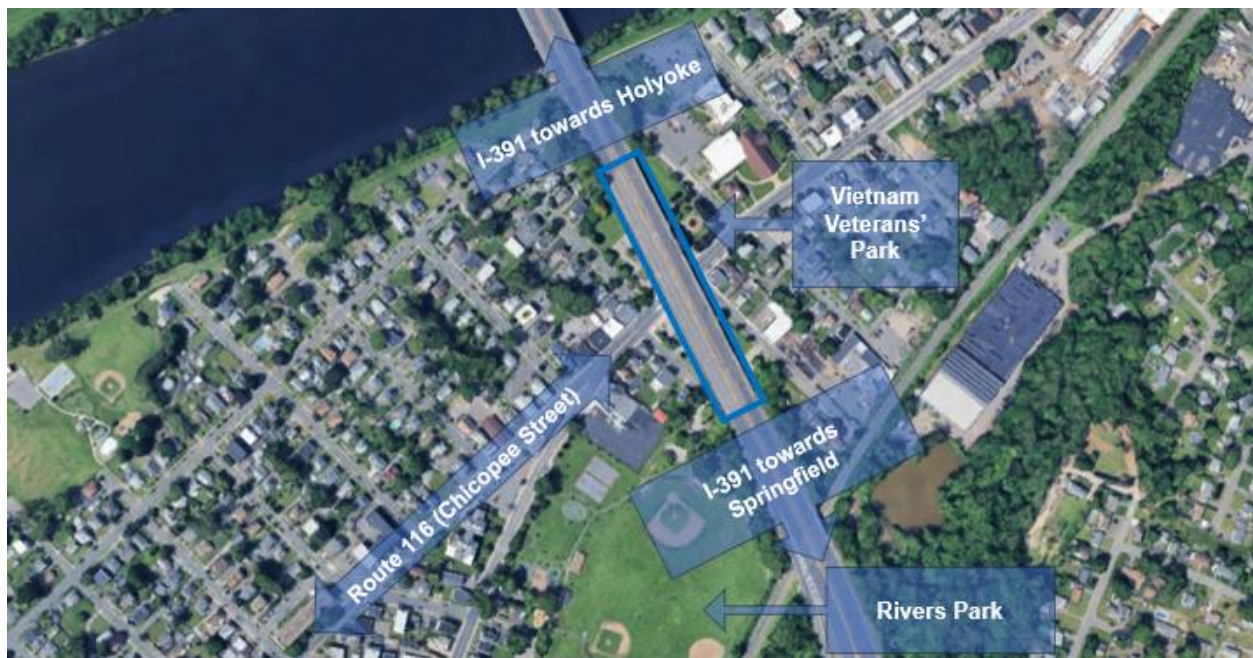
Figure 1: Locus Map