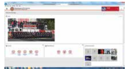
Screenshot of the new system.

We are grateful to have so many helpful partners in bringing this critical update to the training course management system. We expect the LMS to be ready for use in the summer of 2017.