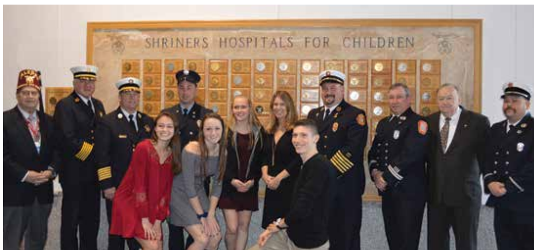
Millis High School contest winners at the awards ceremony with fire officials and contest sponsors.

received gift certificates to Best Buy™ from MaSAFE. The first place team shared $200 in gift cards; the second place team shared $100 in gift cards, and the third place team shared $50 in gift cards.