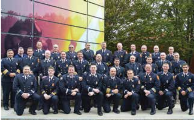
Chief Fire Officer Program