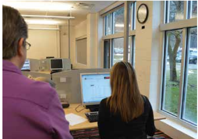
LMS testing in the DFS computer lab.

The LMS implementation team has been working for nearly 18 months to make the new system a reality. Their work has included the clean-up of 18 years worth of data. The team has determined what data should migrate to the new system, how to migrate that data, validated the data, performed user testing, and trained MFA staff on the system. The team had to migrate records of more than 47,000 students, 800 courses and 31,000 training sessions