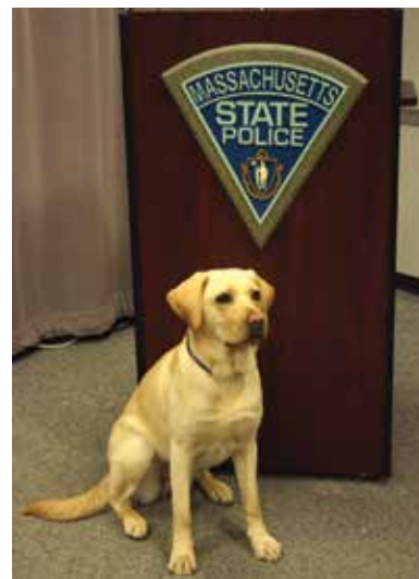
K-9 Winnie of the Computer Crimes Unit.