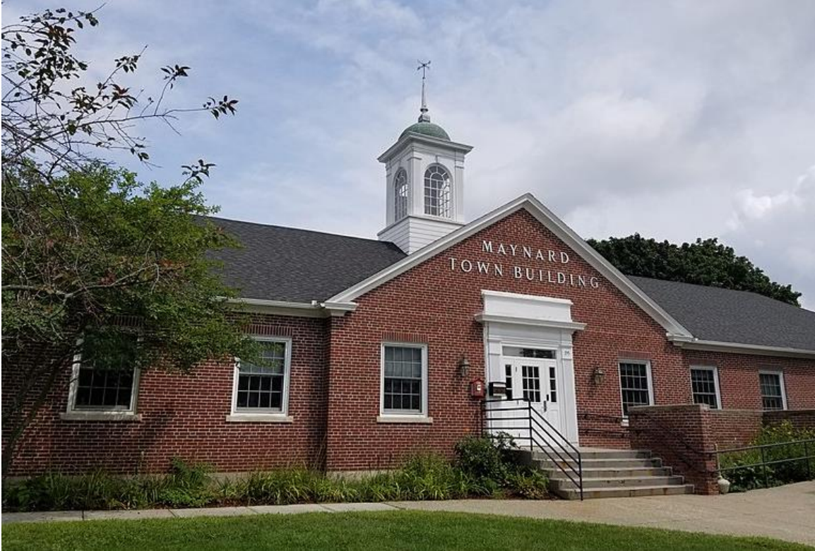
Image: Maynard Town Hall 1