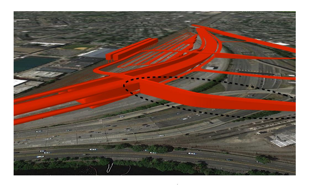
The Great Wall